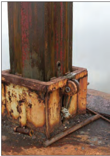
Photos showing spud with securing pin lying alongside (left) and with securing pin inserted (right).

During marine construction work deck barges are held in place by vertical steel shafts known as spuds. The spud equipment typically consists of forward and aft spuds and a diesel engine-powered spud winch. Three methods are available to prevent the spud from accidentally dropping or slipping: latching the winch foot brake; engaging a steel pawl that fits into a notched ring on the outside of the winch drum; and inserting a steel securing pin directly through the fully raised spud, preventing it from free-falling if the winch or cable fails.