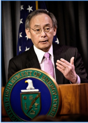
Secretary of Energy, Steven Chu

The Department of Energy (DOE) is pleased to provide its 2012-2015 Diversity and Inclusion Strategic Plan.