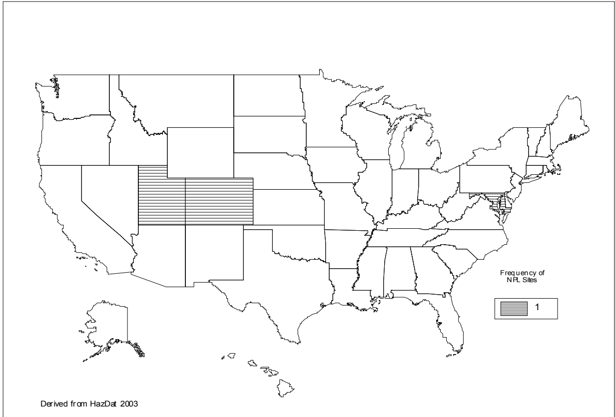
Figure 6-1. Frequency of NPL Sites with Sulfur Mustard Contamination