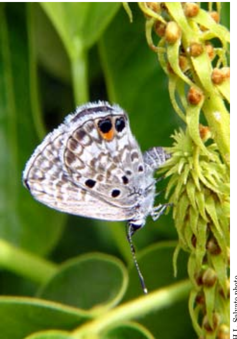
Miami blue butterfly, a species that is a candidate for listing as endangered.

Because of the number of candidates and the time required to list a species, we developed a priority system designed to direct our efforts toward the plants and animals in the greatest need. In our priority system,