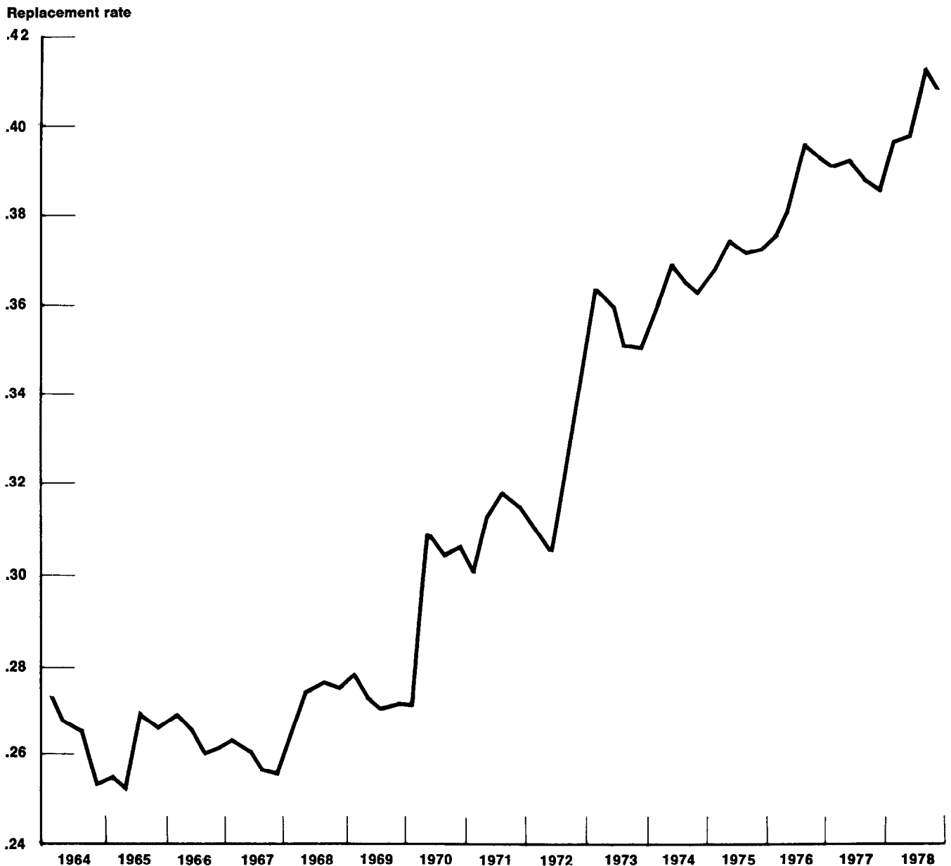
Chart 2.—Ratio of disabled-worker average monthly award to average spendable earnings, quarterly, 1964-78

of the men and 86 percent of the women are not receiving benefits.