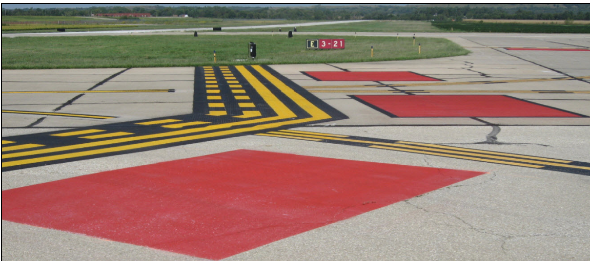
Installed Red Background for SPHS

When repainting surface painted holding position signs (SPHPS), it is a recommended best practice to allow the red paint to cure for 24 hours before painting the white inscriptions. This procedure will result in a better bond between the white inscription and the red background and will prevent flaking of the marking. A future change will be made to AC 150/5370-10E, Standards for Specifying Construction of Airports , to address this issue.