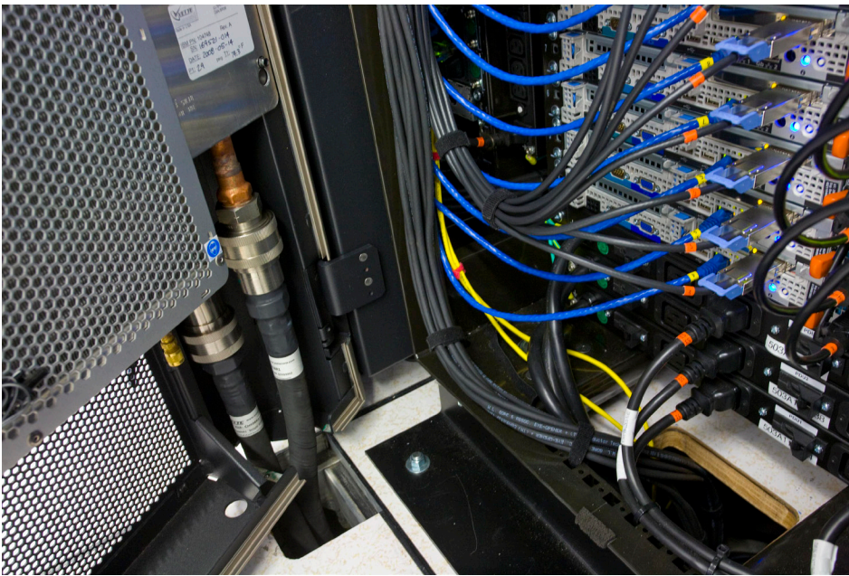
Figure 2: RDHx hose connections

eliminating chiller operation. Because RDHx devices perform well at warmer chilled water set-points, they are typically more energy efficient than CRAC units. Potentially, a data center could eliminate chiller use completely by having the RDHx device reject heat using indirect evaporative cooling in a cooling tower.