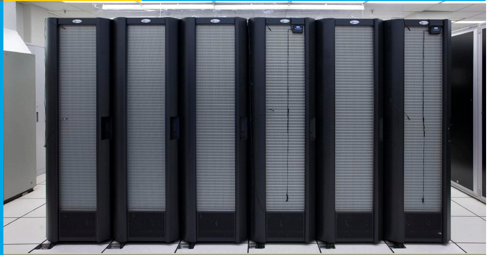
Figure 1: Passive Rear Door Heat Exchanger devices at LBNL

As data center energy densities in power-use per square foot increase, energy savings for cooling can be realized by incorporating liquid-cooling devices instead of increasing airflow volume. This is especially important in a data center with a typical under-floor cooling system. An airflow-capacity limit will eventually be reached that is constrained, in part, by under-floor dimensions and obstructions.