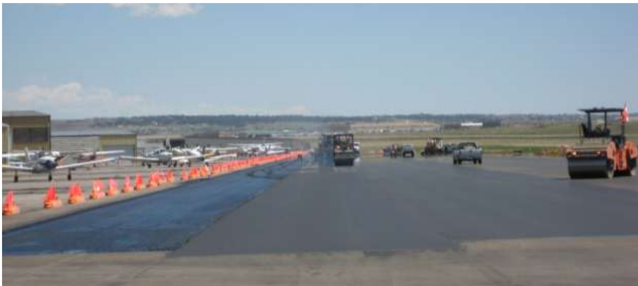
Figure 2-6 Low Profile Barricades

(5) Air Operations Area – Runway/Taxiway Intersections. Use highly reflective barricades with lights to close taxiways leading to closed runways. Evaluate all operating factors when determining how to mark temporary closures that can last from 10 to 15 minutes to a much longer period of time. However, even for closures of relatively short duration, close all taxiway/runway intersections with barricades. The use of traffic cones is appropriate for short duration closures.