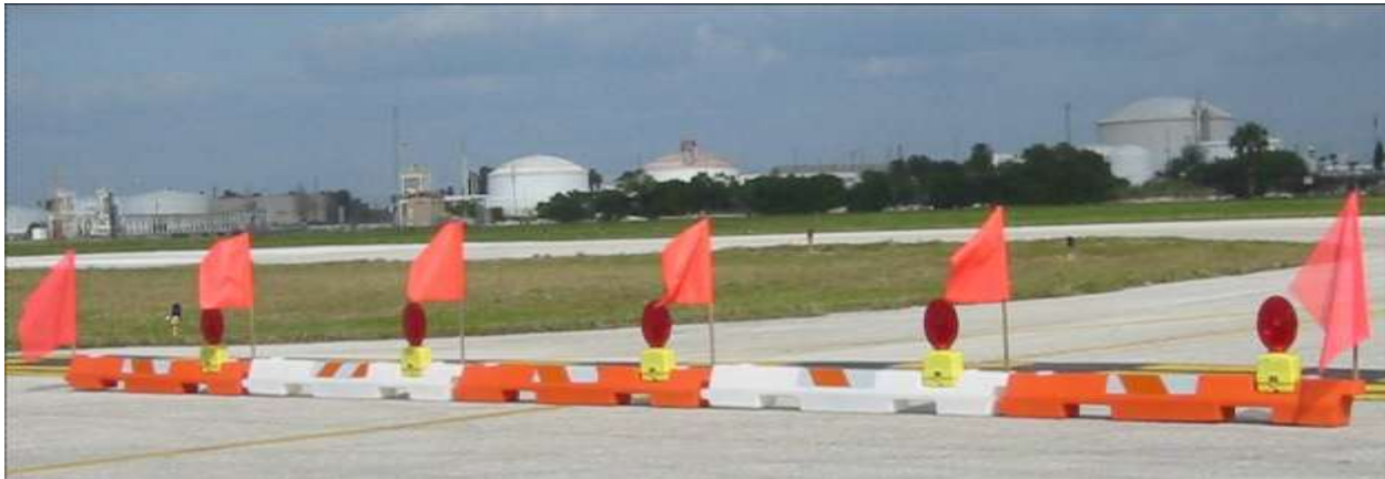
Figure 2-5 Interlocking Barricades

white stripes; and/or signs to separate all construction/maintenance areas from the movement area. Barricades may be supplemented with alternating orange and white flags at least 20 by 20 in (50 by 50 cm) square and securely fastened to eliminate FOD. All barricades adjacent to any open runway or taxiway / taxilane safety area, or apron must be as low as possible to the ground, and no more than 18 in high, exclusive of supplementary lights and flags. Barricades must be of low mass; easily collapsible upon contact with an aircraft or any of its components; and weighted or sturdily attached to the surface to prevent displacement from prop wash, jet blast, wing vortex, or other surface wind currents. If affixed to the surface, they must be frangible at grade level or as low as possible, but not to exceed 3 in (7.6 cm) above the ground. Figure 2-5 and Figure 2-6 show sample barricades with proper coloring and flags.