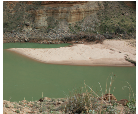
March 11, 2008 (immediately after the HFE)