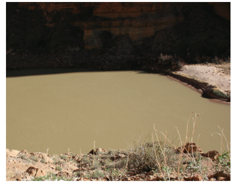
March 4, 2008 (before the HFE)

Although HFEs can rebuild sandbars by depositing a fraction of new tributary sand at higher elevations along shorelines, higher flows also efficiently export available sand supplies downstream. An important objective of any HFE strategy would be to achieve a neutral sand budget, so that the total sand exported downstream does not exceed ongoing tributary sand inputs over the long term. Sand storage in the main stem is greatest immediately following tributary floods, before downstream export results from daily dam releases. With only about 10 percent of the pre-dam sand sup-