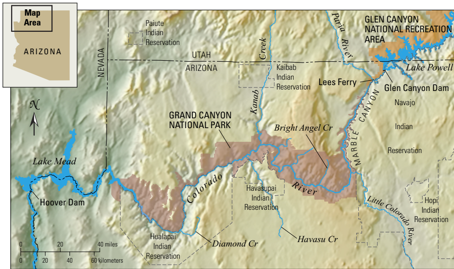
Map of the Colorado River downstream of Glen Canyon Dam showing the river corridor between Lake Powell and Lake Mead reservoirs.