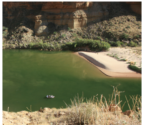
September 30, 2008 (about 6 months after the HFE)

Repeat photographs of a long-term sandbar study site on the Colorado River about 45 miles downstream from Lees Ferry, Arizona, showing how that sandbar was affected by the 2008 high-flow experiment (HFE) and by erosion in the subsequent 6 months. All of the photographs were taken by a remote camera at about 4 p.m. and at a water level associated with a flow rate from Glen Canyon Dam of about 8,500 cubic feet per second (ft 3 /s). The river flows from left to right. Boat (18 feet long) in bottom photo indicates scale.