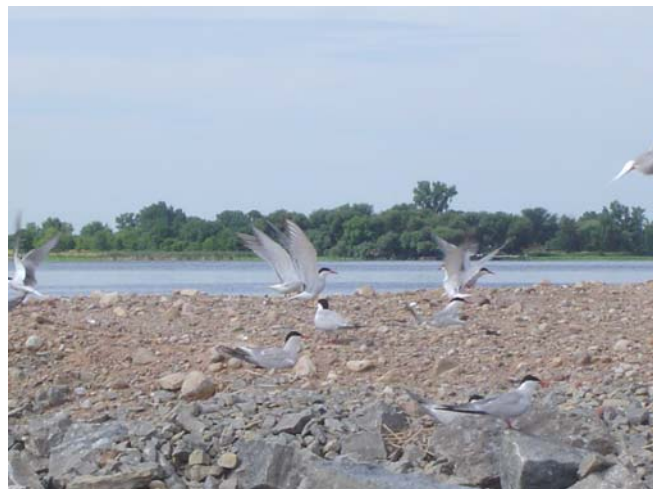
Terns colonized, nested, and produced offspring in first season after the islands were established.