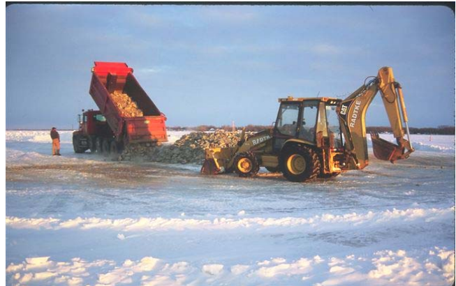
Trustee Council contracted with heavy equipment operators to place rocks on ice over shoals, to become small islands after the ice melted.

The Trustee Council followed the sage old advice "build it and they will come" to help restore a local population of common terns. Early in 2008, during the coldest winter in several years, local contractors were able to drive dump trucks over thick ice to deposit over 600 tons of rocks, sand, and dirt in an area over a shallow shoal. When the ice melted in the spring, the new material sank to form a small rocky island that provides ideal nesting habitat for terns that build nests on sparsely vegetated islands. The island is less than one acre, no bigger than many backyards in the town of Green Bay. Although they had not expected immediate results, trustee biologists were extremely pleased to discover 11 nesting pairs this past summer. The 2008/2009 winter season was again cold enough to allow the trustees to expand on the success of this project by depositing rocks in a nearby location to build another island. A local conservation club will assist the trustees in managing the island and monitoring nesting success.