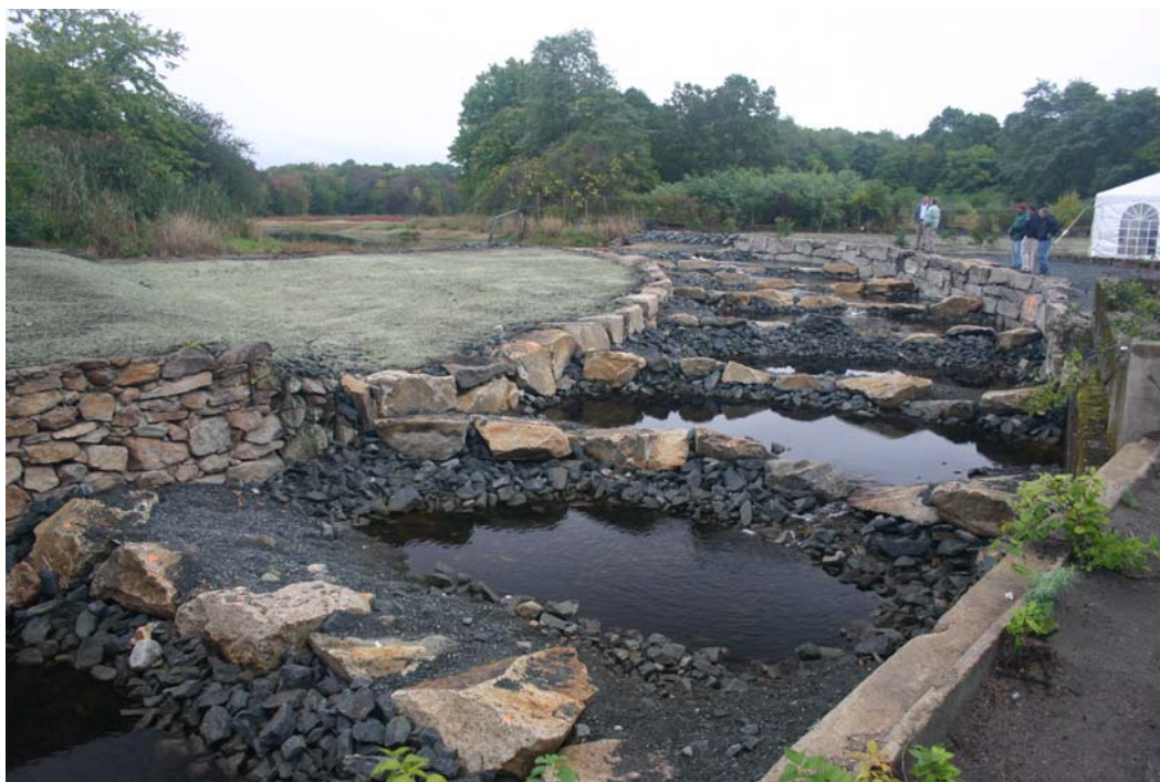
Newly constructed step pool at the former Acushnet Sawmill Dam on the Acushnet River (shown during low flow conditions) will facilitate fish passage and breeding.

New Bedford Harbor is a major commercial fishing port and industrial center in southeastern Massachusetts on Buzzards Bay. From the 1940s to the 1970s, electrical parts manufacturers discharged wastes containing polychlorinated biphenyls (PCBs) and toxic metals into New Bedford Harbor, resulting in high levels of contamination throughout the waters, sediments and biota of the Harbor and parts of Buzzards Bay. Hundreds of acres of marine environment were highly contaminated. Biological effects of the contamination include reproductive impairment and death of anadromous fish and migratory birds throughout the estuary, along with significant losses of marine biodiversity in areas of high contamination.