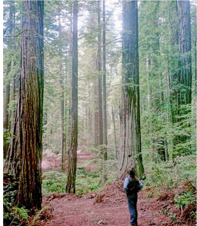
Over 600 acres of old-growth redwood forest is being protected to provide habitat for the marbled murrelet

During the M/V Stuyvesant oil spill near Humboldt Bay in 1999, an estimated 135 marbled murrelets were oiled and killed. To compensate for this injury, the Natural Resource Trustees, including the U.S. Fish and Wildlife Service and the State of California, negotiated as part of the settlement an agreement with the responsible party to provide for restoration to benefit the marbled murrelet. This restoration included purchase of a conservation easement to protect 135 acres of pristine old-growth redwood forest, as well as an additional 222 acres of surrounding buffer area to protect the old growth stand from logging. This parcel is occupied by marbled murrelets and is known as the Miracle Mile.