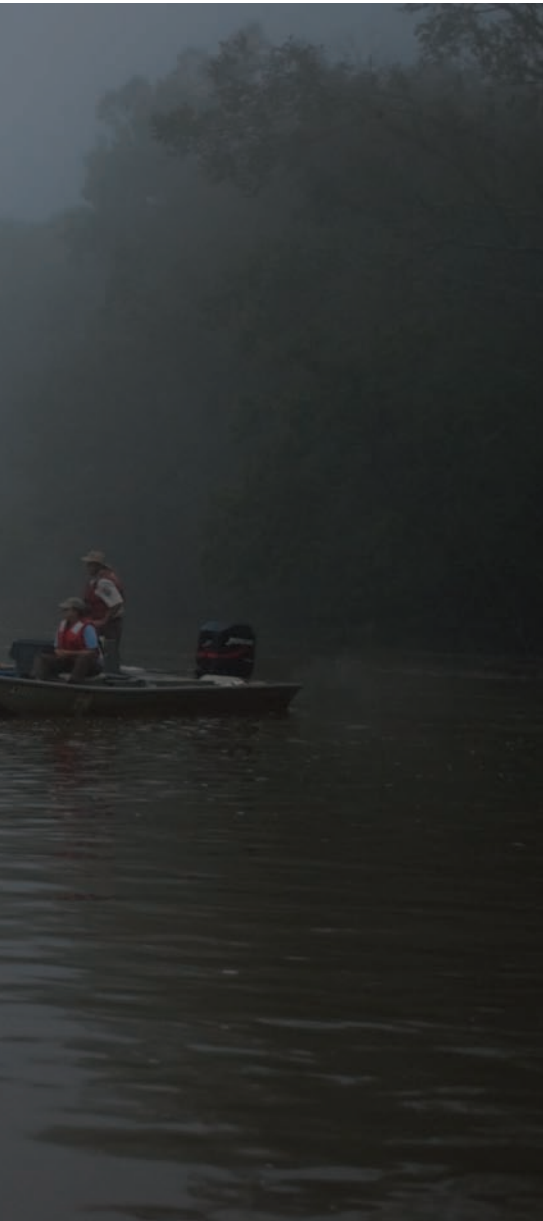
Angley attempt netting Gulf sturgeon in the