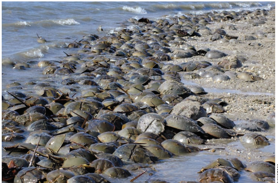
Large waves of horseshoe crabs leave behind masses of eggs, some of which are consumed by red knots and other shorebirds.