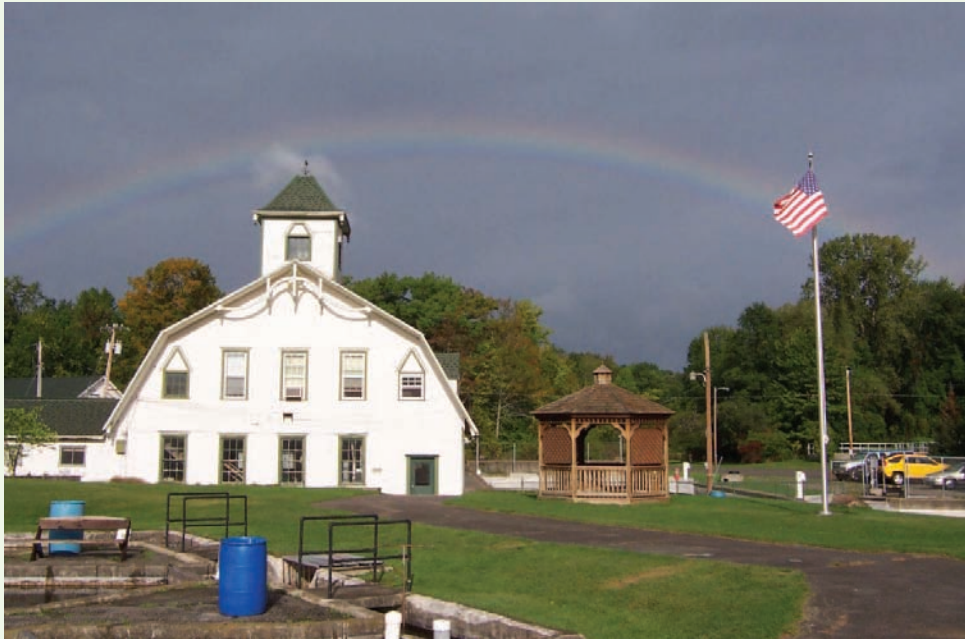
Under the rainbow, New York's 148-year-old Caledonia Fish Hatchery benefits from Sport Fish Restoration funding derived from angler expenditures.

The Dingell-Johnson Sport Fish Restoration (SFR) program has a 61-year tradition of funding state hatchery programs. One early SFR grant of $6,375 helped develop disease-resistant strains of trout in New York. According to data from the