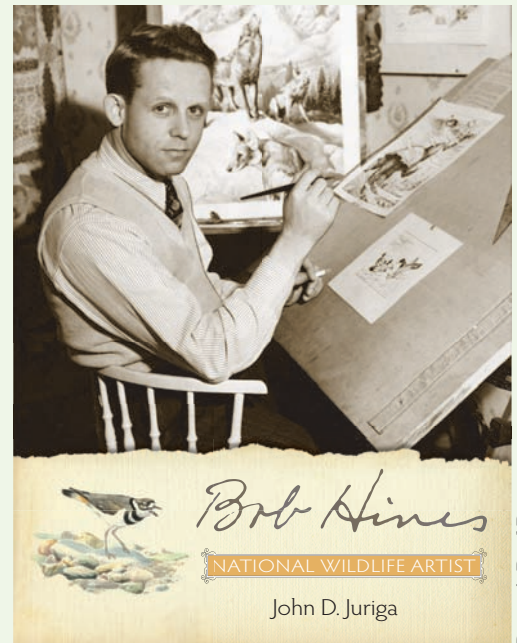
Beaver's Pond Press