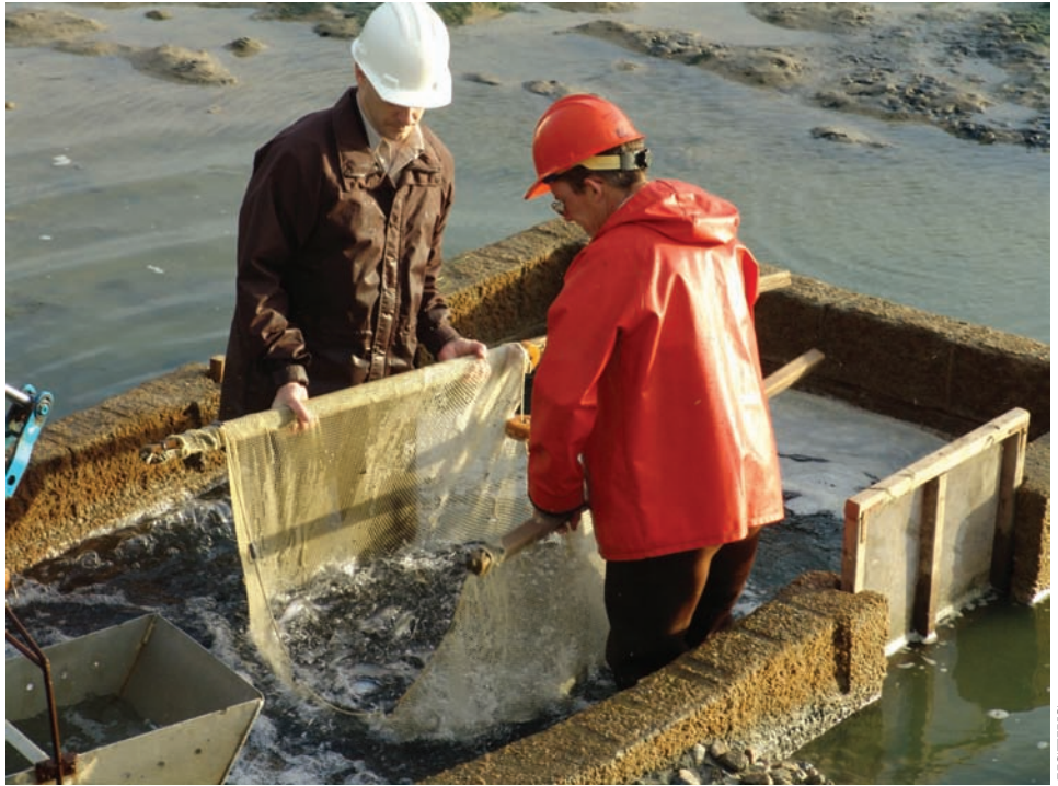
Biologists at Edenton National Fish Hatchery, North Carolina, collect young striped bass for eventual stocking in the wild.