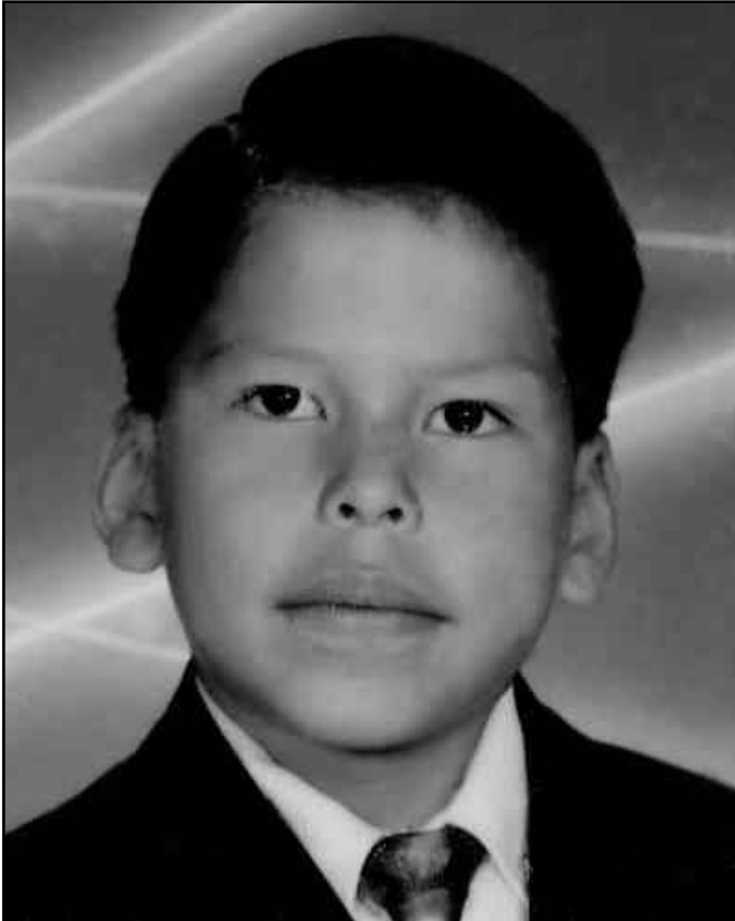
Male, Age Now: 16 Brown eyes, Black hair