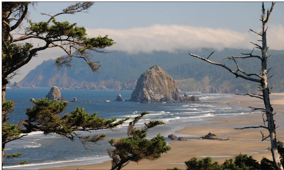
Haystack Rock, Oregon Islands NWR - a large seabird nesting colony

Climate change is one of the greatest environmental and conservation challenges of the 21st Century. The impacts of climate change will exacerbate existing stressors on our landscapes, fish and wildlife, and natural and cultural resources. Expected physical changes include rising mean sea level, widespread melting of snow and ice, changes in ocean currents and precipitation patterns, ocean acidification, and increased coastal erosion and flooding rates.