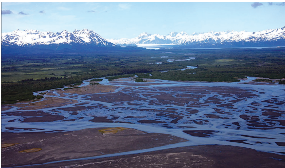
Dangerous River with Harlequin Lake and Yakutat Glacier in the background.

The North Pacific region already has a number of major partnerships underway that capitalize on large-scale biological planning and conservation design. The LCC will build upon and support these existing efforts to broaden collaboration and help advance science planning and application across the landscape as we face climate change and related natural resource challenges. Conservation benefits can be more effectively