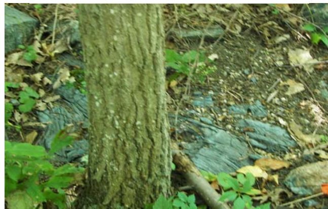
Figure 1: Exposed Paint Sludge

Between 1990 and 2004, Ford performed four unplanned removals of paint sludge and other contaminated wastes at the Site. Ford conducted three of the removals after EPA deleted the Site from the NPL in 1994. This situation occurred because some aspects of the initial Site investigation were limited, which impeded early discovery of all possible paint sludge deposits at the Site. EPA could have required Ford to conduct a more comprehensive Site survey and ensured using available aerial photographs to identify potential paint sludge locations outside the originally scoped areas. EPA could have also conducted a more thorough search for records involving waste disposal activities at the Site by enforcing the disclosure requirements on Ford. Had EPA taken these actions, it may have produced information supporting a more comprehensive Site investigation or identified additional paint sludge deposits. Under EPA orders, Ford is conducting an ongoing, comprehensive Site investigation.