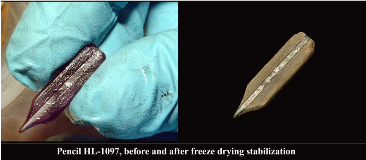
Pencil HL-1097, before and after freeze drying stabilization