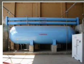
Alternative Fuel Pilot Plant and fueling island (above) and hydrogen low-pressure and two high-pressure storage tanks with PEM electrolyzer (inset at left).