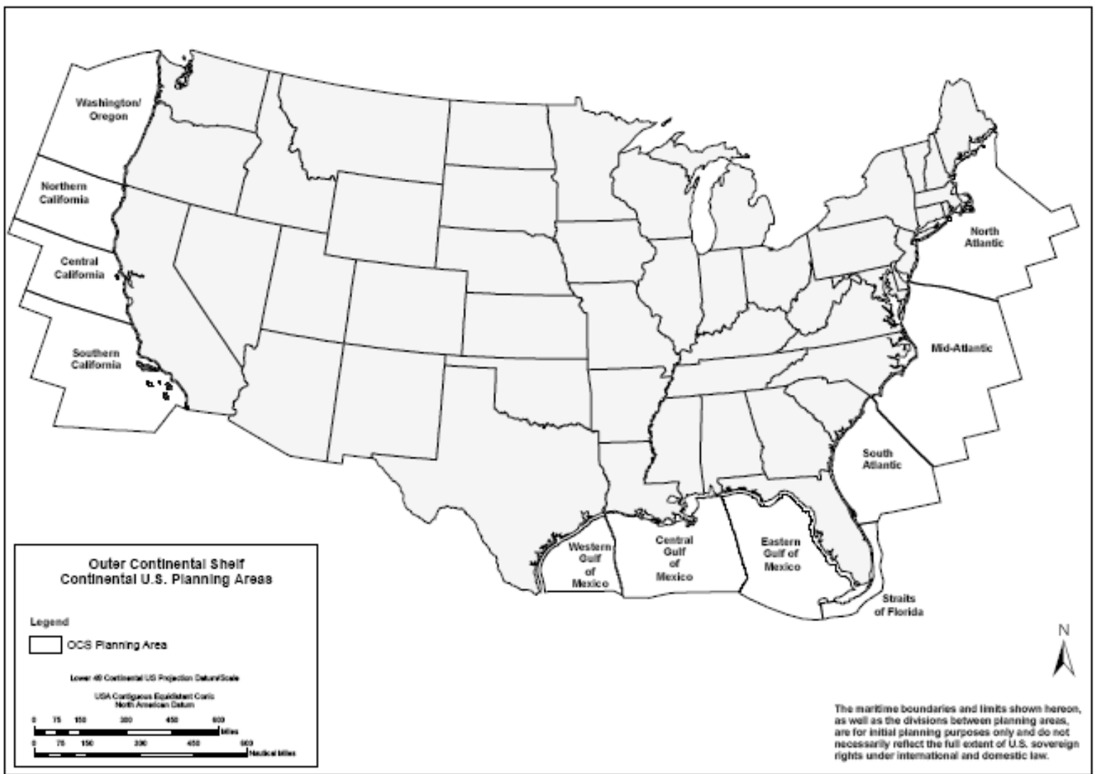
Figure 1: Lower 48 Planning Areas