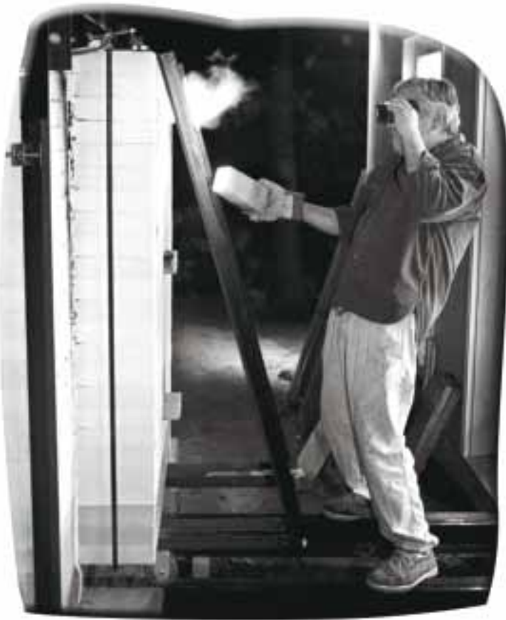
Like those in many occupations, tasks in some crafting specialties require taking precautions—including the use of welding glasses while checking a kiln.

example, could lead to a job as a recreational therapist. Or if you enjoy science as well as pet care, a job as a veterinarian or biologist might agree with you.