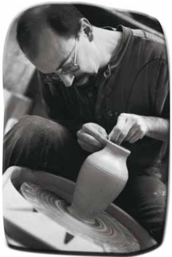
Some potters use a potter's wheel to create the pieces they sell.

Those who want to teach paddling can earn certification from the American Canoeing Association. The association offers certification for teachers of rafting, canoeing, river kayaking, sea kayaking, and swift water rescue. It also certifies teachers in adaptation techniques for boaters who are disabled. Each certification requires classes at an approved school and a passing score on a certification exam.