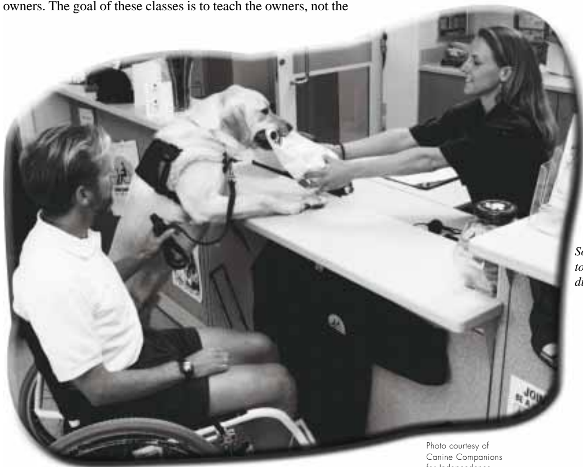
Some trainers teach dogs to assist people who have disabilities.

After 6 months, the people who will use the dogs’ services