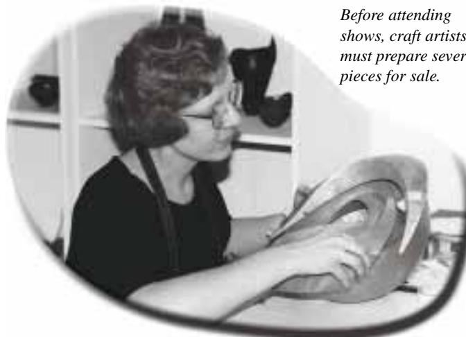
Before attending shows, craft artists must prepare several pieces for sale.

Earnings. BLS does not have earnings data for craftshow artists. But according to a survey sponsored by the Craft Organizations