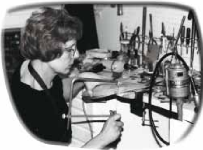
Craft artists often use special tools for cutting metal and other materials.