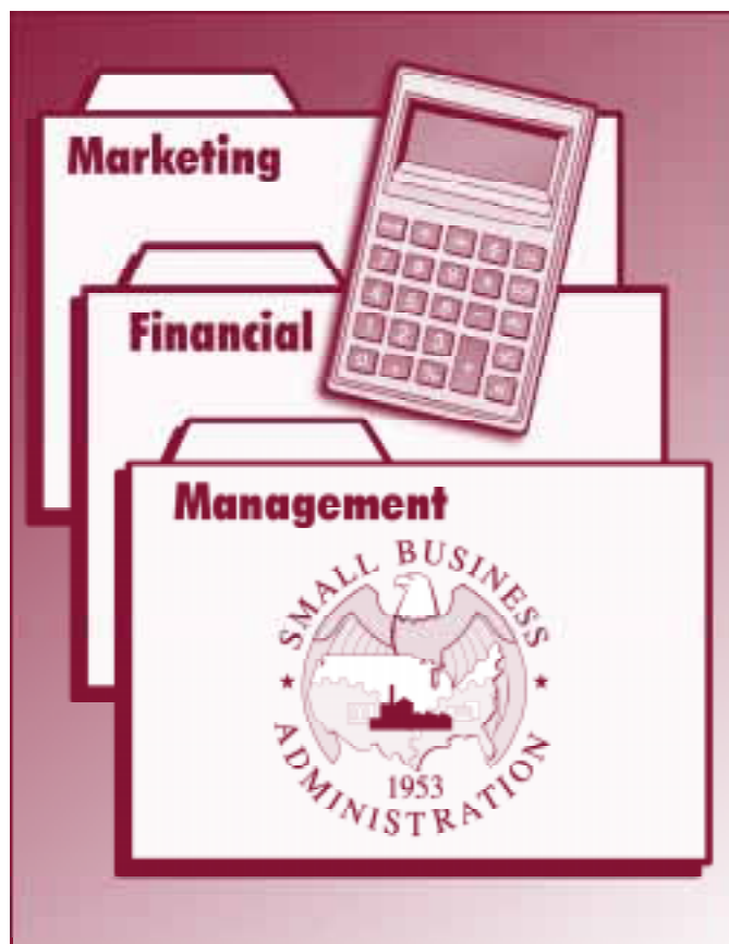
Preparing a business plan allows you to anticipate and solve many problems before you open for business.

Begin informally by talking to your friends and neighbors to find out if they would buy what you have to offer. Explain why your product or service benefits them and what makes your business different from others like it. Then, do an in-depth investigation of your market. Consider the size of the market and your expected share. Determine the maximum price customers will pay for your product or service and whether your prices will be competitive. Finally, identify the strengths and weaknesses of your competitors and how your business compares with them. Try to target gaps in the local economy where op-