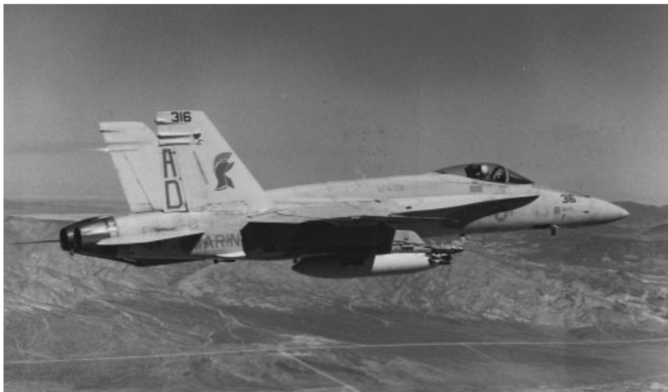
A squadron F/A-18A Hornet in flight, May 1987 (Courtesy Robert Lawson Collection).