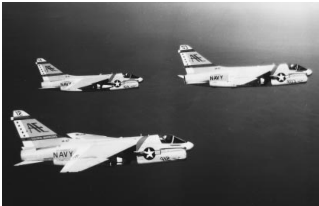
A flight of squadron A-7B Corsair IIs in 1971.

4 Dec 1983: In response to hostile fire against U.S. reconnaissance aircraft from Syrian positions in Lebanon, VA-87 aircraft participated in a coordinated strike against Syrian radar, communications and artillery positions overlooking the Multi-National Peacekeeping Forces. All squadron aircraft completed their mission and returned to the carrier.