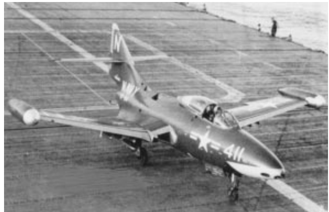
A squadron F9F-5 Panther on the deck of Hornet (CVA 12) during her world cruise in 1954.