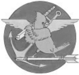
This was the first insignia approved for and used by the squadron.

Redesignated Strike Fighter Squadron EIGHTY SIX (VFA-86) on 15 July 1987. The second squadron to be assigned the VA-86 designation and the first squadron to be assigned the VFA-86 designation.