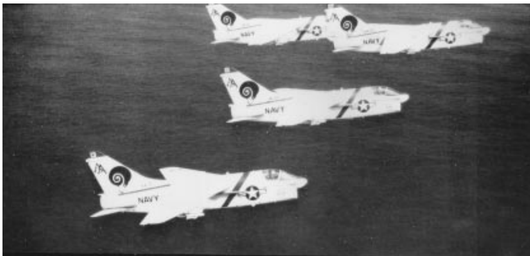
A formation of squadron A-7E Corsair IIs in flight during their deployment to the Med aboard Forrestal (CV 59) in 1974.