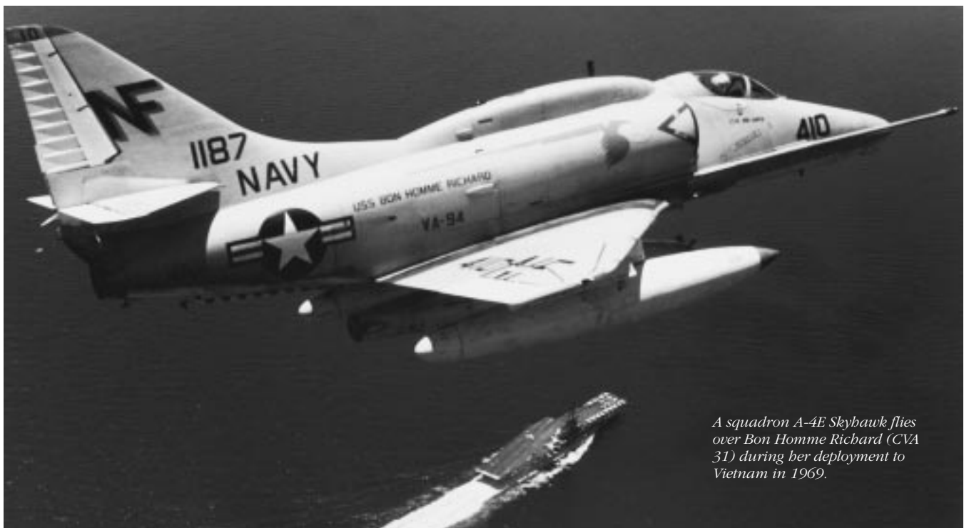
A squadron A-4E Skyhawk flies over Bon Homme Richard (CVA 31) during her deployment to Vietnam in 1969.