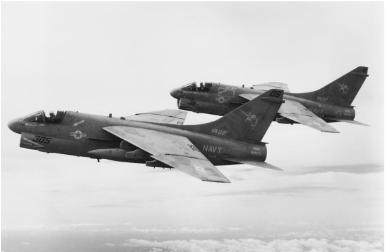
Two squadron A-7E Corsair IIs in flight, showing the low-visibility paint scheme, 1987.