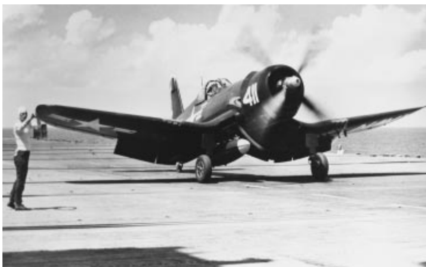
A squadron F4U-4 Corsair prepares to launch from Tarawa (CV 40), September 1951.