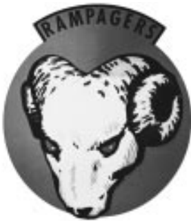
The squadron adopted the ram head insignia in 1957 and has used this design for the past four decades.

A new squadron insignia was approved by CNO on 12 April 1957. Colors for the Rampager insignia are: a light blue background outlined in gold; blue scroll outlined in black with black lettering; white ram's head with black markings; red eyes; and white horns with yellow, green and black markings.