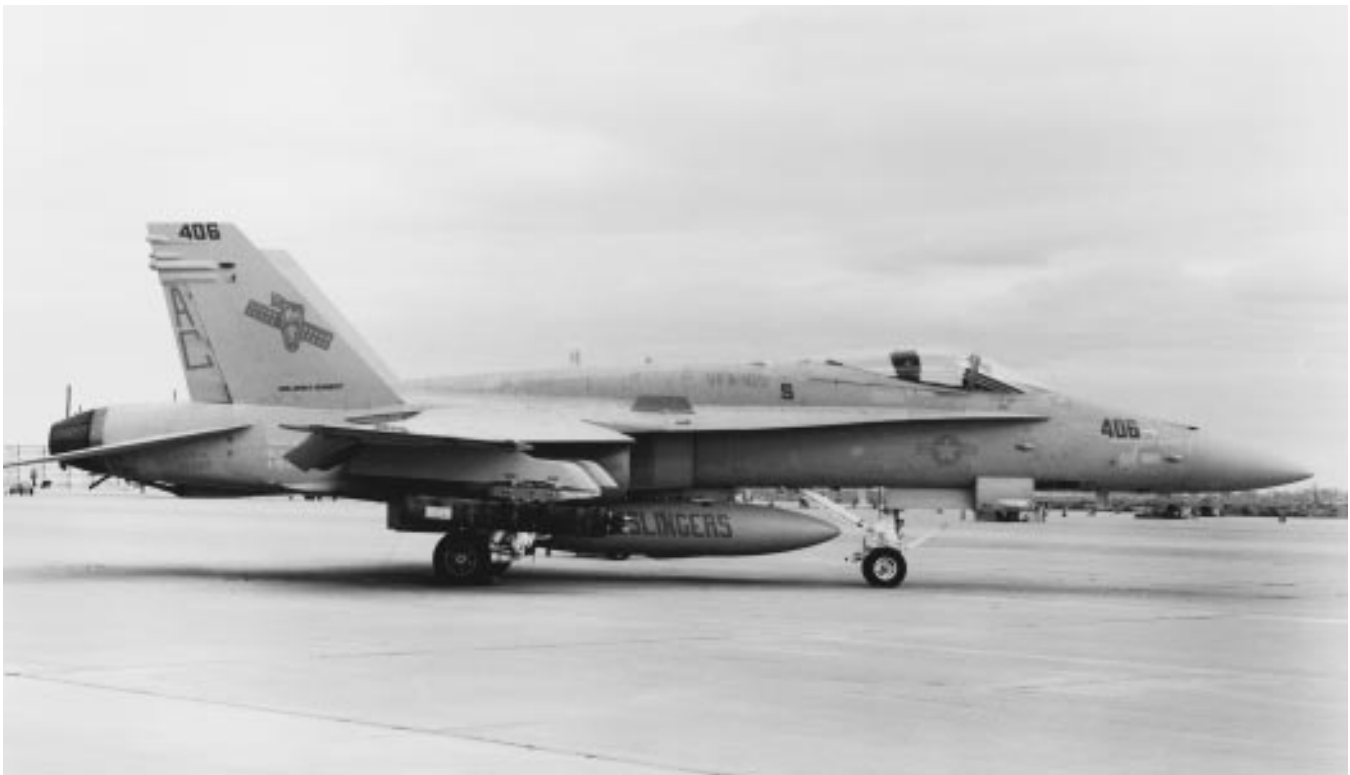
A squadron F/A-18C Hornet at NAS Fallon, Nevada, March 1992.