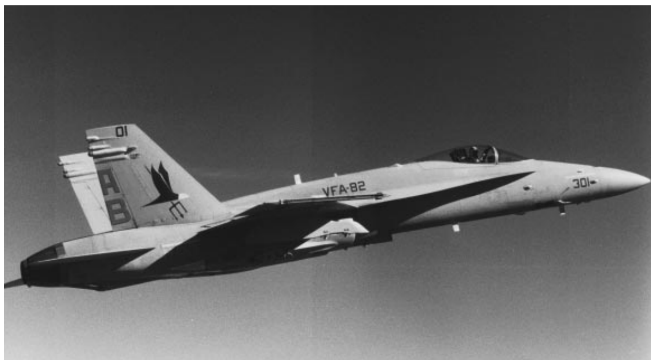
A squadron F/A-18C Hornet in flight, 1987.