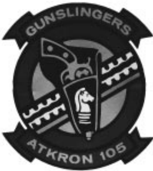
In 1984, a modification was approved for the squadron's insignia that added an upper scroll with the nickname Gunslingers . When the squadron was redesignated VFA, the designation in the lower scroll changed from ATKRON 105 to STRKFITRON 105 .