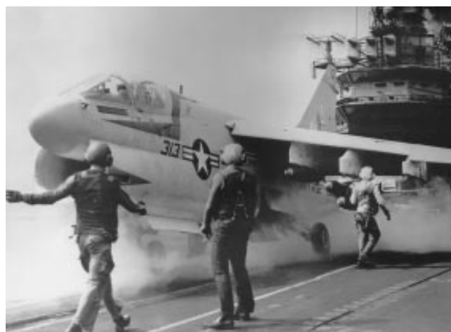
A squadron A-7A Corsair II preparing to launch from Coral Sea (CVA 43) while deployed to Vietnam in 1969.

12 Feb-7 Apr 1990: VFA-82 was embarked in Constellation (CV 64) during its transit from the west coast to the east coast via the Straits of Magellan.