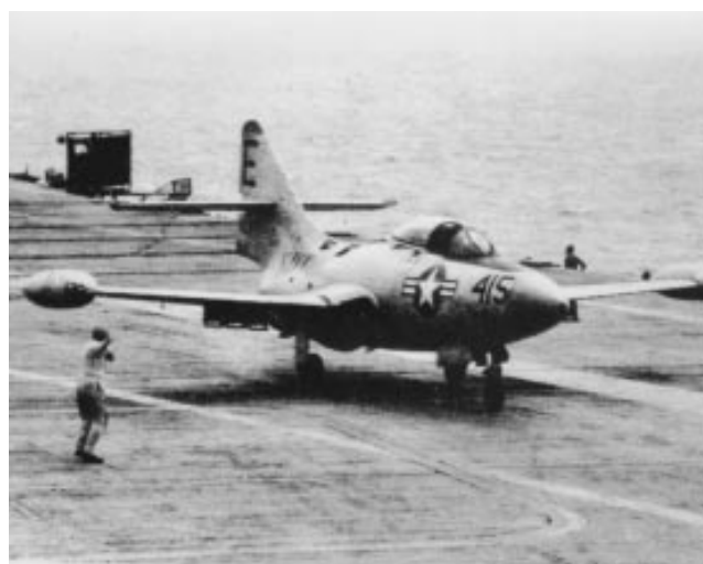
A squadron F9F-5 Panther on the deck of Antietam (CVA 36) during her cruise in 1953.