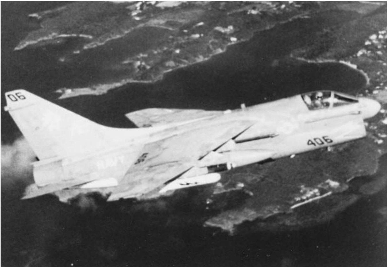
A squadron A-7E Corsair II with a low-vivibility paint scheme, 1984.