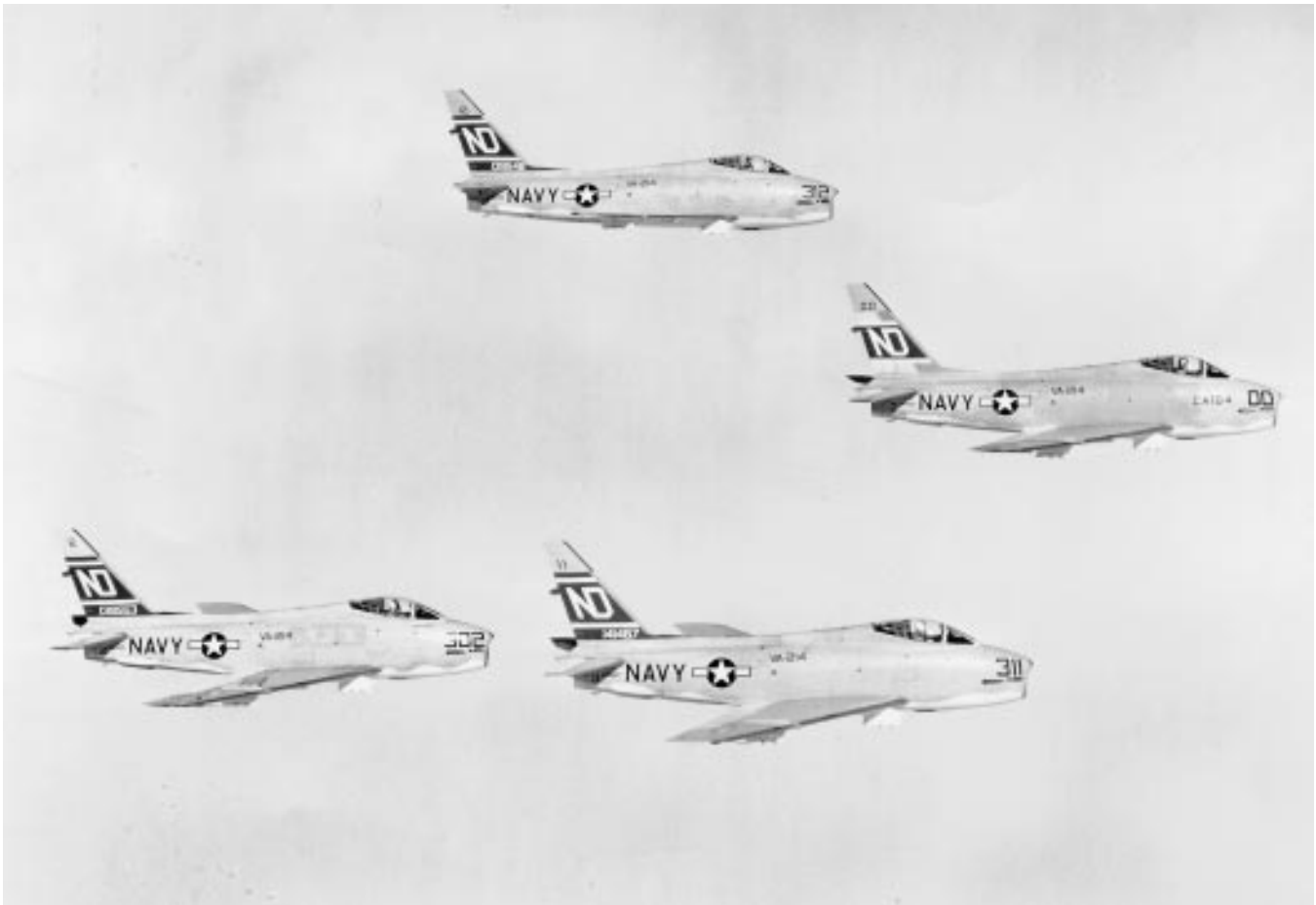
A flight of squadron FJ-4Bs, circa 1957 or 1958.

† The tail code was changed from Z to ND in 1957. The effective date for this change was most likely the beginning of FY 58 (1 July 1957).