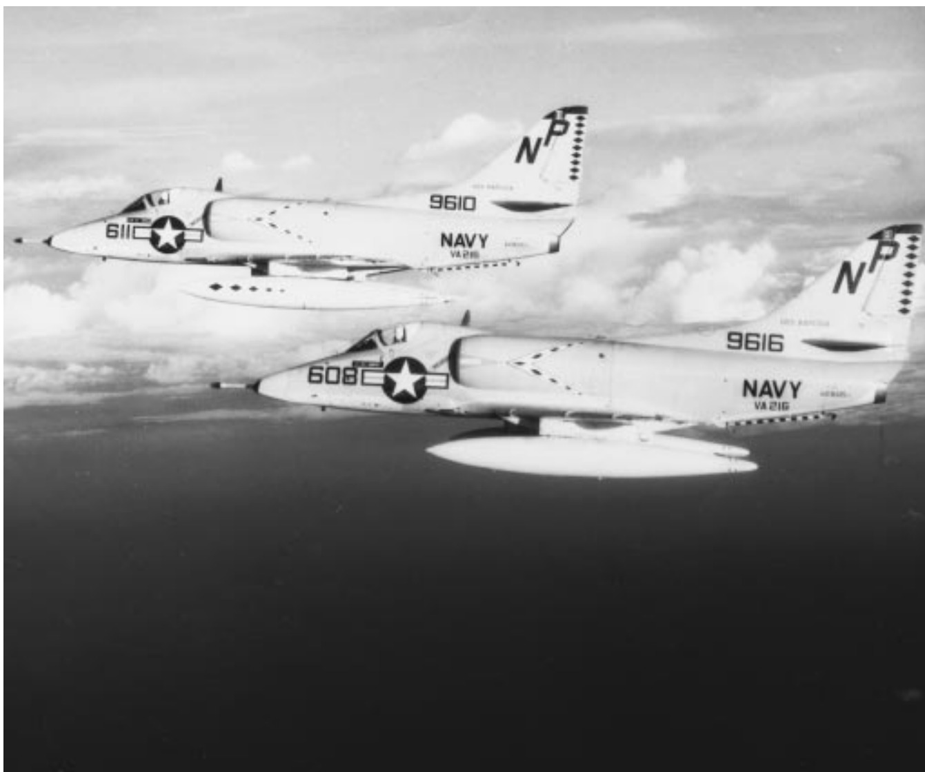
Two squadron A-4C Skyhawks in flight, circa 1964–1965.