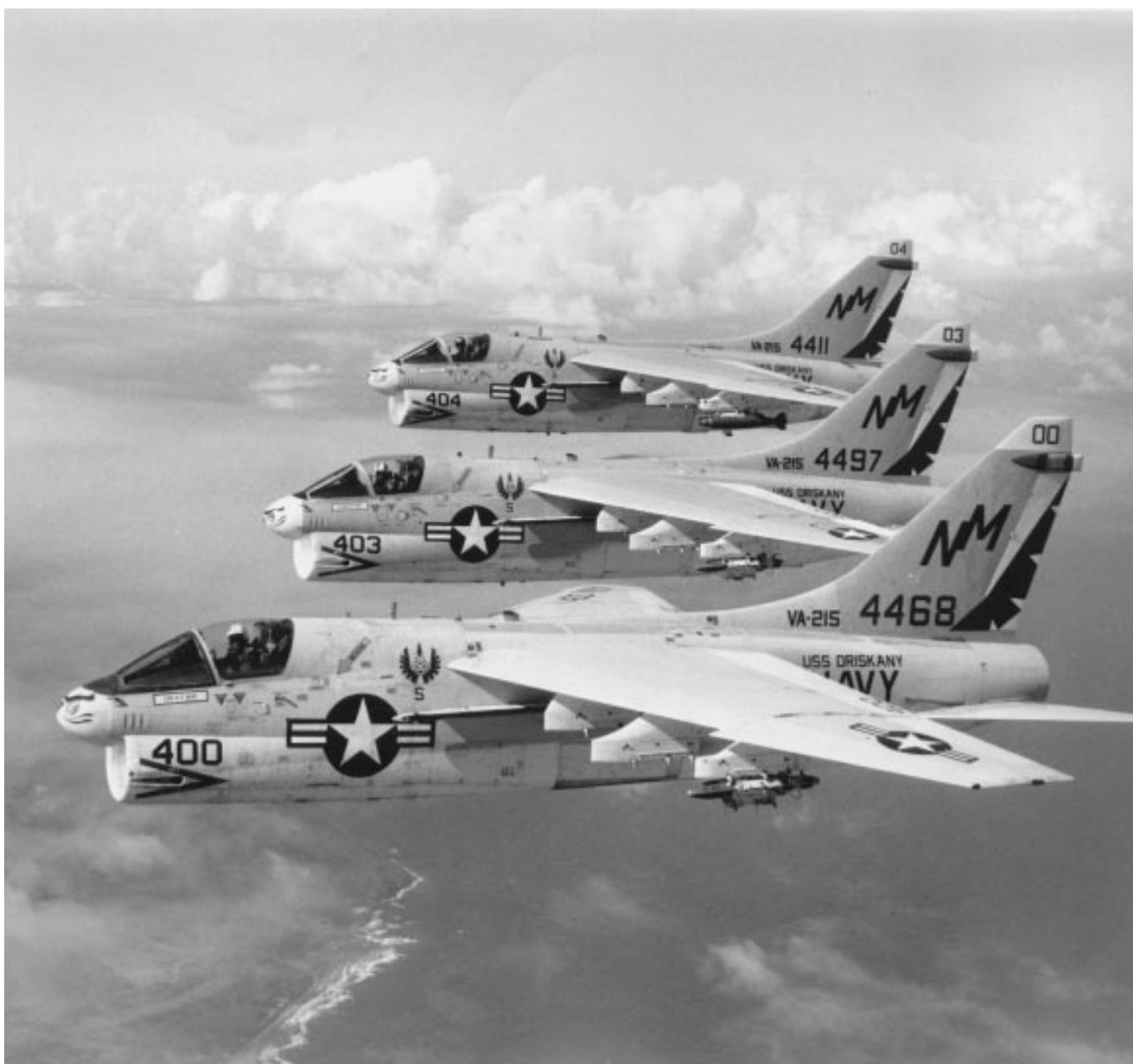
A formation of squadron A-7B Corsair IIs in 1972.