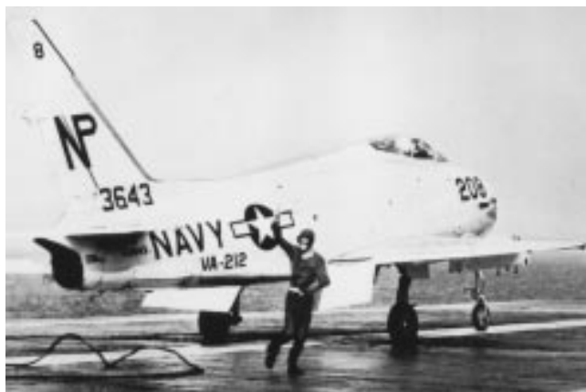
A squadron FJ-4B Fury preparing for launch from Lexington (CVA 16) during her 1959 deployment to WestPac.