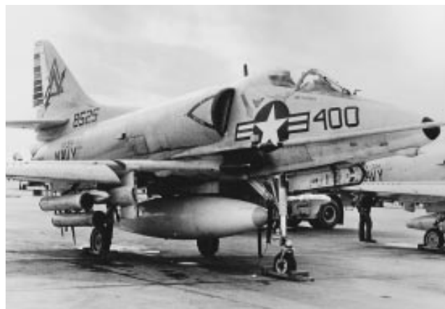
A squadron A-4C Skyhawk, circa 1970 or 1971.

Aug 1988: VA-304 was the first reserve squadron to receive and operate the A-6E Intruder.