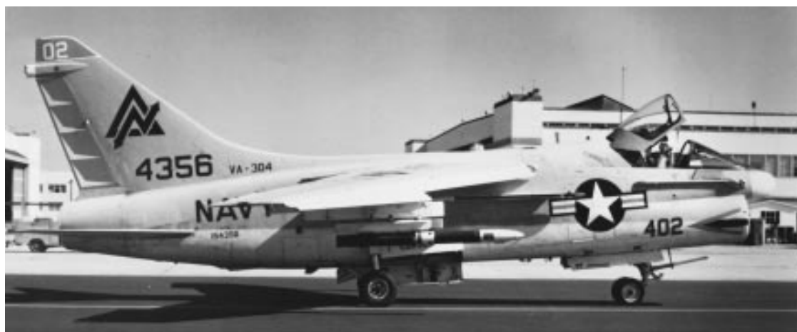
A squadron A-7A Corsair II at NAS Alameda, California, in 1975.