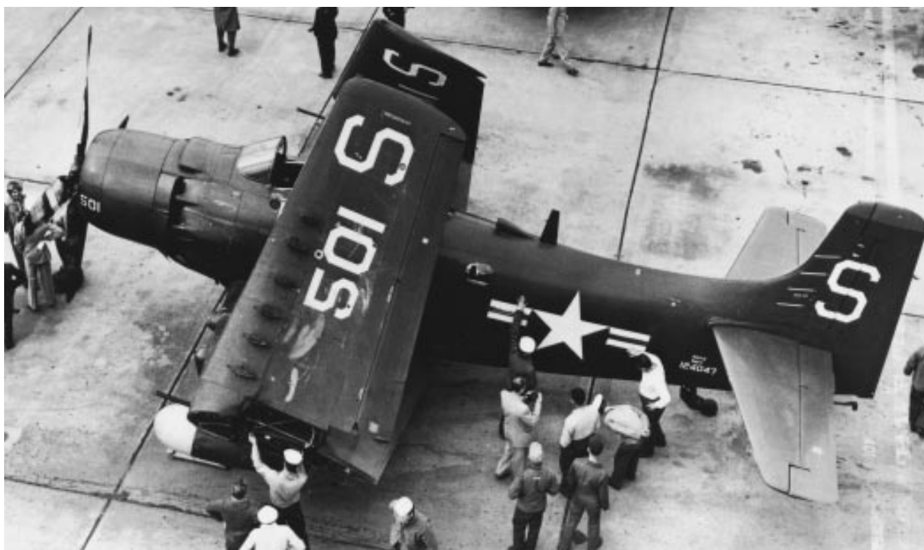
Squadron AD-4Q Skyraiders at NAS San Diego, California, in December 1950 following their return from a Korean combat tour aboard Valley Forge (CV 45) (Courtesy Robert Lawson Collection).