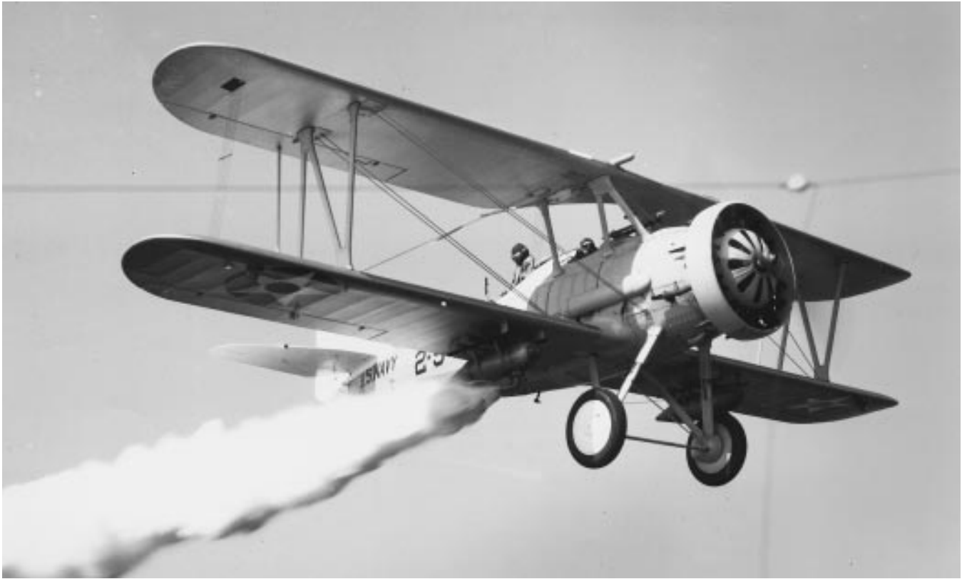
This is a close-up view of the squadron O2U laying a smoke screen.