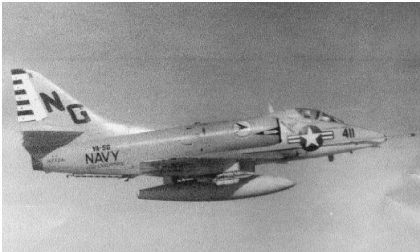
A squadron A-4C Skyhawk with Enterprise markings, 1966.