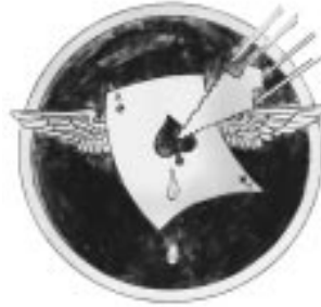
The squadron's second insignia, approved in 1948, depicts the nickname "Copperheads."

A new squadron insignia was approved by CNO on 14 February 1951, a year after the squadron had been redesignated VF-54. The insignia's design was based on the statement "through Hell or High Water." Colors for this insignia were: sky blue background in the upper half and sapphire blue in the lower half of the insignia, the overall insignia outlined in black; a crimson devil's head was encircled by yellow, red and amber flames; the devil's features include black hair,