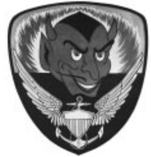
The squadron's last insignia, the devil's head, gave them the nickname "Hell's Angels."

eyebrows, mustache and highlights; his eyes were white with emerald pupils and vermilion iris; the mouth was white; and gold anchor, shield and wings. The squadron's motto was Angeli Inferni meaning Hell's Angels. When the squadron was redesignated VA-54 in 1956, it continued to use the Hell's Angels insignia.