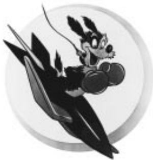
The squadron's first insignia was designed by Walt Disney Productions.

The squadron's first insignia was approved by CNO on 17 July 1945. The insignia was designed by Walt Disney Productions.