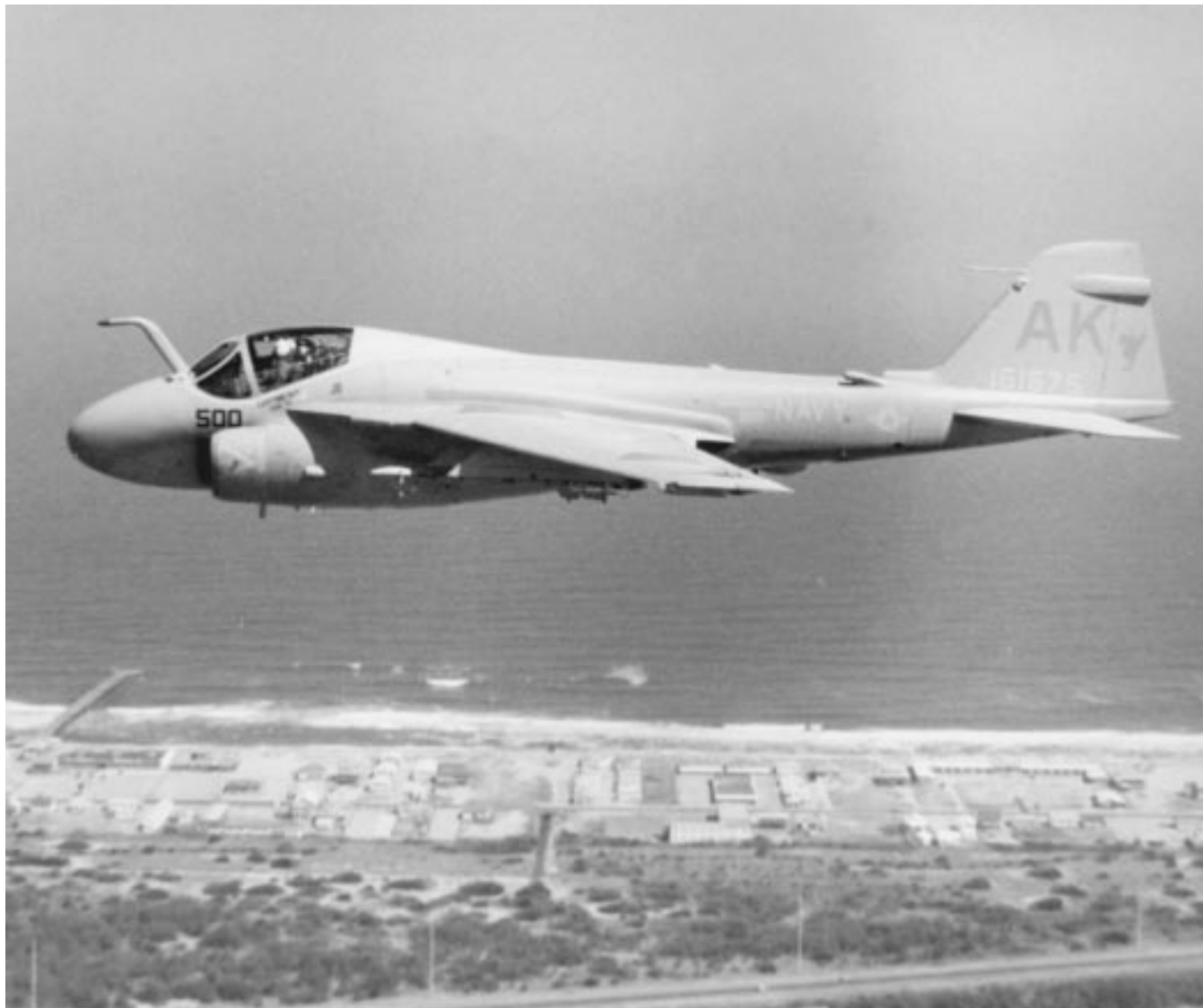
A squadron A-6E Intruder; note the flying seahorse insignia on the tail.