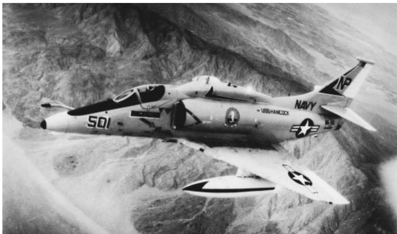
A squadron A-4F Skyhawk piloted by Lieutenant Duncan, 14 February 1975.