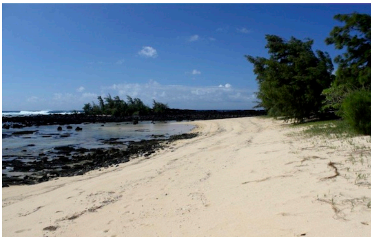
Figure 2: ‘Īliopi‘i point, Kalaupapa peninsula, Moloka‘i, a rural community that has developed a relatively conflict-free relationship with monk seals. As a result, monk seals have flourished in this area.

In a few unique places in the archipelago monk seals are regarded as a natural part of the ecosystem and human-monk seal conflicts appear to be minimal (Figure 2). These areas tend to be rural and fairly isolated communities that are characterized by a higher degree of self-sufficiency, and where familial traditions and local decision-making processes are preserved. On Ni‘ihau Island, for example, monk seals became established nearly three decades ago. Community members discussed the social impacts associated with monk seal colonization (e.g, increased presence of sharks), and ultimately decided to act as stewards of the animals (Robinson, 2008). As a result, a sub-population has become established and residents have developed a stewardship ethic towards the species. A similar situation is occurring in the isolated Kalaupapa community on Moloka‘i Island, where another sub-population is thriving in the MHI, and where community residents largely leave seals alone. In these communities, fishers and other ocean users will move away from areas where seals are visible in order to minimize interactions.