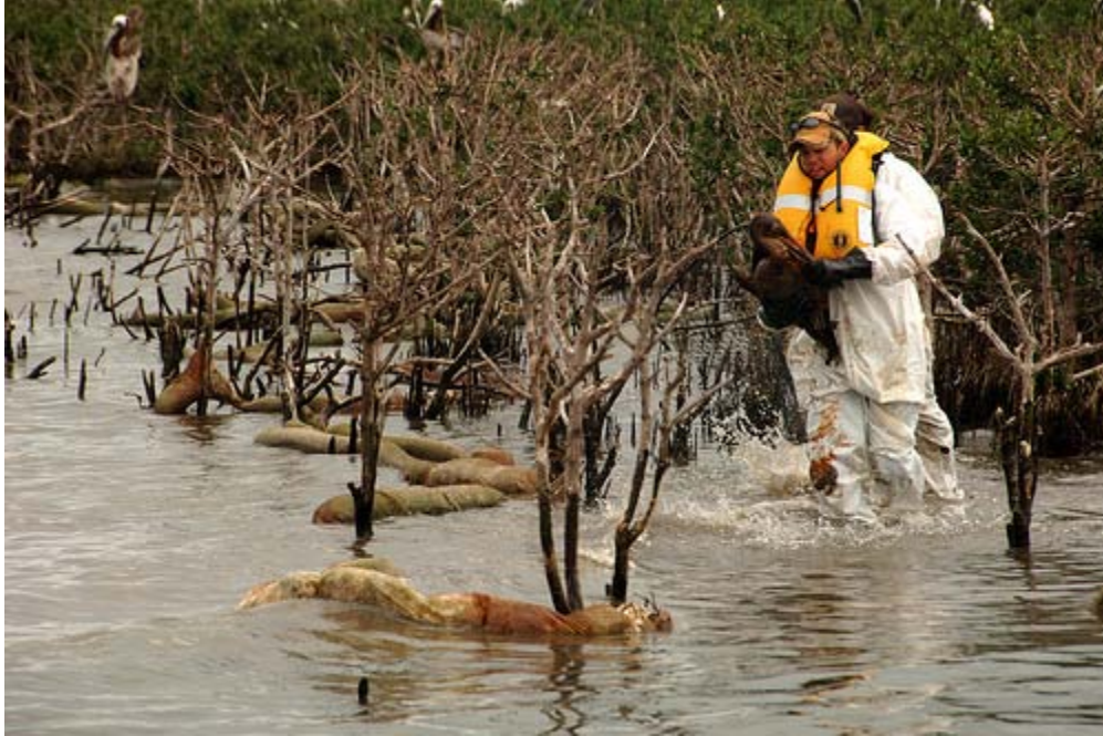
Deepwater Horizon Response Bird Rescue.