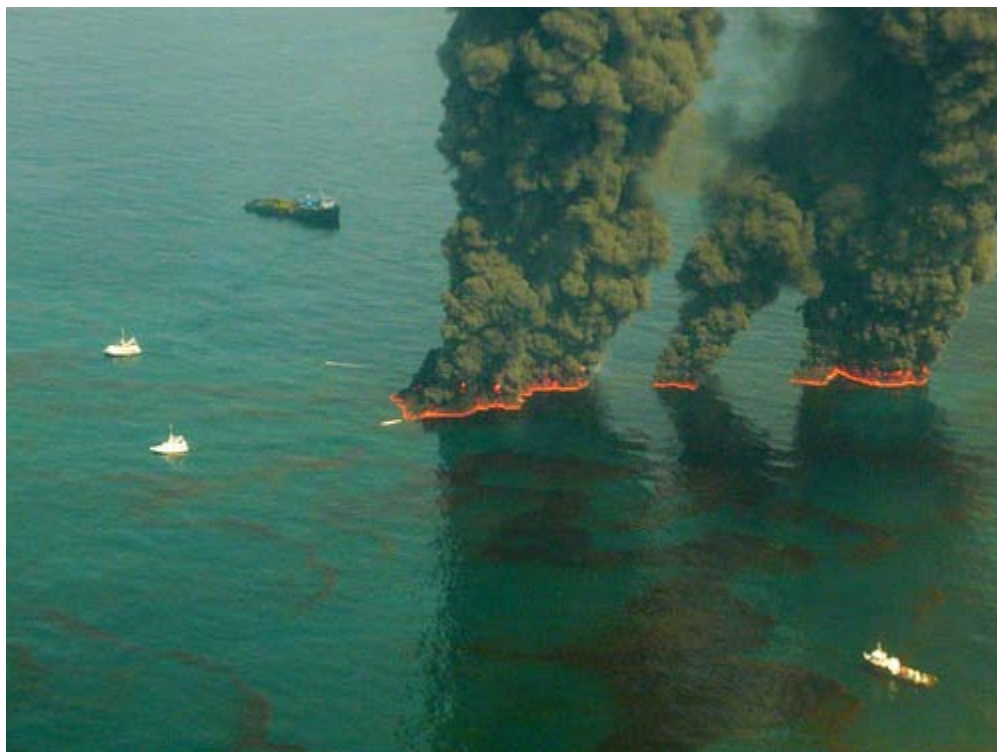
Aerial view of oil being burned from the Deepwater Horizon/BP incident, May 19, 2010.