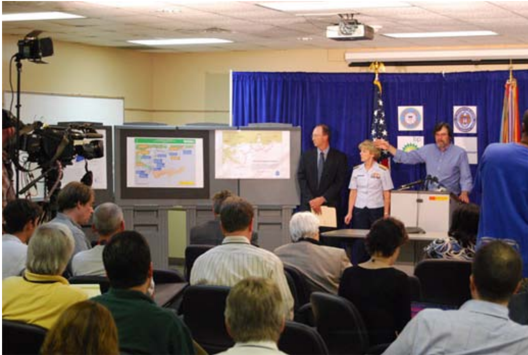
NOAA provides critical scientific information to the response effort dealing with the oil leak in the Gulf of Mexico.