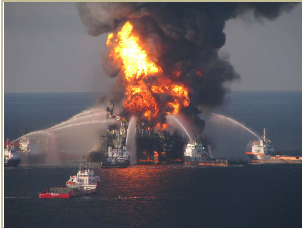
Gulf of Mexico – Deepwater Horizon fire.