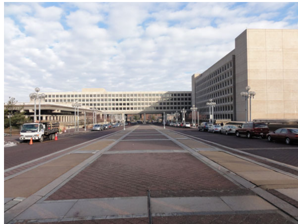
Figure 2: Existing Conditions at Maryland Avenue