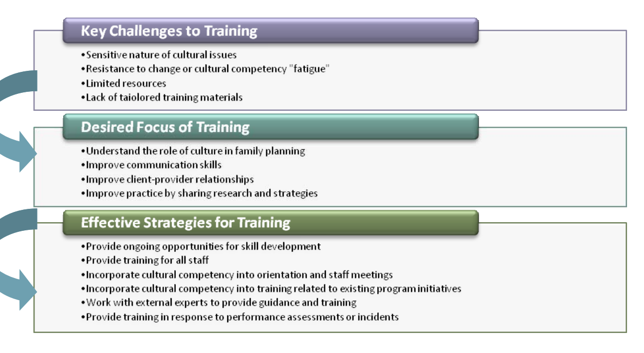
Figure 3. Strategies for Training Staff in Culturally Competent Practices

The review of literature also emphasized that simply recruiting and retaining a diverse staff is not enough to ensure the delivery of culturally competent care. Even in situations where providers share the same racial/ethnic backgrounds as their clients, there may be other types of differences present that inhibit effective interaction, such as differences in age or gender. Similarly, providers may have limited experience providing care to certain subpopulations such as lesbian, gay, bisexual, and transgender (LGBT) individuals or those with disabilities. Therefore, the research recommends that staff should receive regular, comprehensive training to improve skills in culturally competent care delivery—that helps them work effectively with any individual or group. As depicted in Figure 3 and the narrative that follows, the key informants, program administrators and staff, and RTC staff supported the research findings and shared their thoughts about key challenges to training staff in culturally competent practices, the desired topics, and effective implementation strategies.