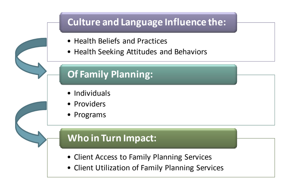
Figure 2. The Impact of Culture and Language on Access to and Utilization of Family Planning Services

The study participants stressed the importance of demographics such as race/ethnicity, age, gender, socioeconomic status, and sexual orientation. Yet, as depicted in Figure 1 and described in the following section, they moved beyond ideas tied to these categories to provide concrete, family-planning specific examples of how culture and language are embedded in health beliefs and practices and health seeking attitudes and behaviors – and ultimately affect clients' ability to access and utilize services.