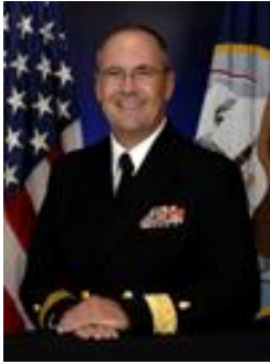
Commander - Rear Admiral