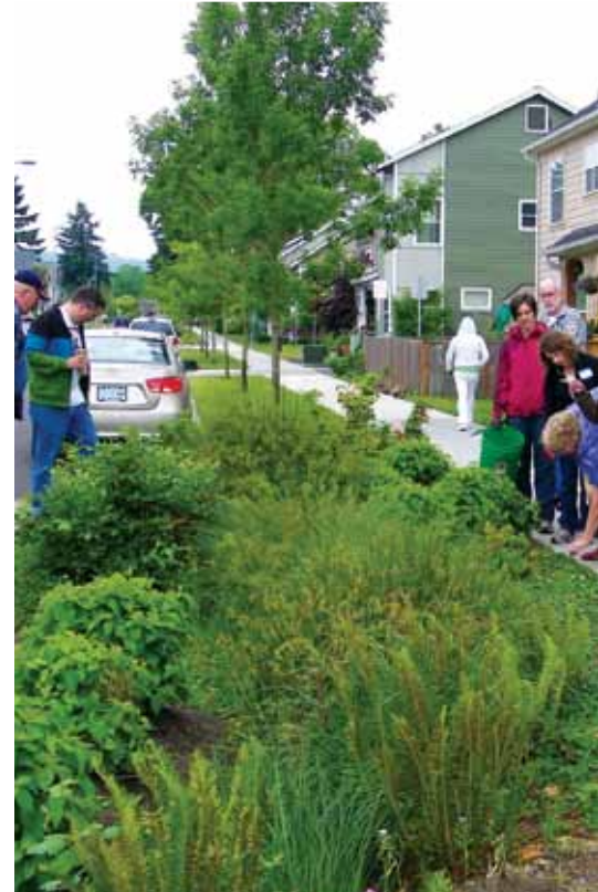
Rain gardens, such as these, effectively treat the New Columbia neighborhoods stormwater runoff, while also creating lovely public spaces.