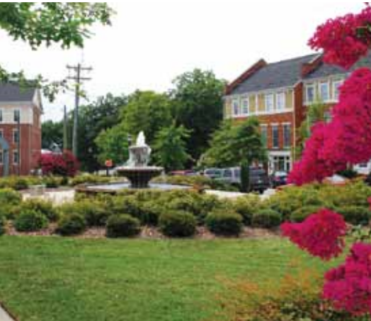
Southside Square, shown here, is flanked by live-work and traditional townhouses. An infill condo project has been built to the south of the square.

Since 2002, the Transit-Oriented Development Housing Incentive Program has allocated more than $3.1 million for local transportation projects. Now in its fourth cycle, the program, which promotes high-density, transit-oriented development, will make an additional $3 million in funding available to San Mateo communities. To be eligible for the program, residential projects must have a minimum density of 40 units per acre and be located within 1/3 of a mile of a transit station. Funding from past program cycles has been used to improve access to transit stations, create more walkable streetscapes, and expand transit options. For the latest cycle, the program, in support of the Great Boulevard Initiative, will award funding to projects along El Camino Real, a major transportation corridor. The county hopes that providing financial incentives for development along this corridor will further revitalization efforts to rebuild this underutilized thoroughfare.