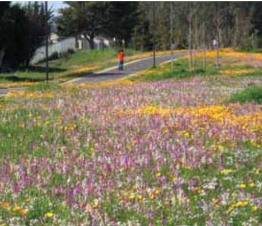
Centennial Way is a 3-mile, Class 1 bicycle and pedestrian trail connecting the San Bruno and the South San Francisco BART stations.