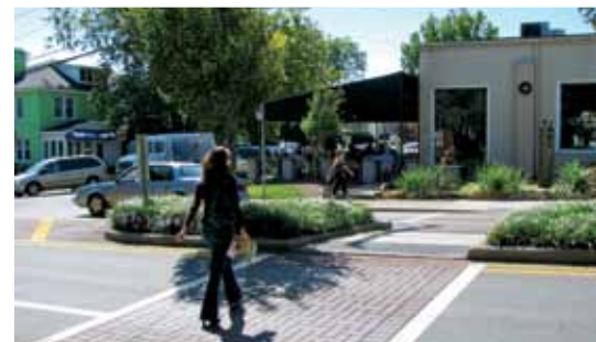
Elizabeth Avenue connects uptown Charlotte to one of the city's historic suburbs. In a collaborative effort, Elizabeth Avenue was reconstructed to be more pedestrian friendly with more landscaping and improved crosswalks.