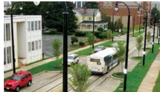
The effect of the Urban Street Design Guidelines is apparent on Elizabeth Avenue, where people, cars, and buses coexist and attractive tree-planting is accommodated.