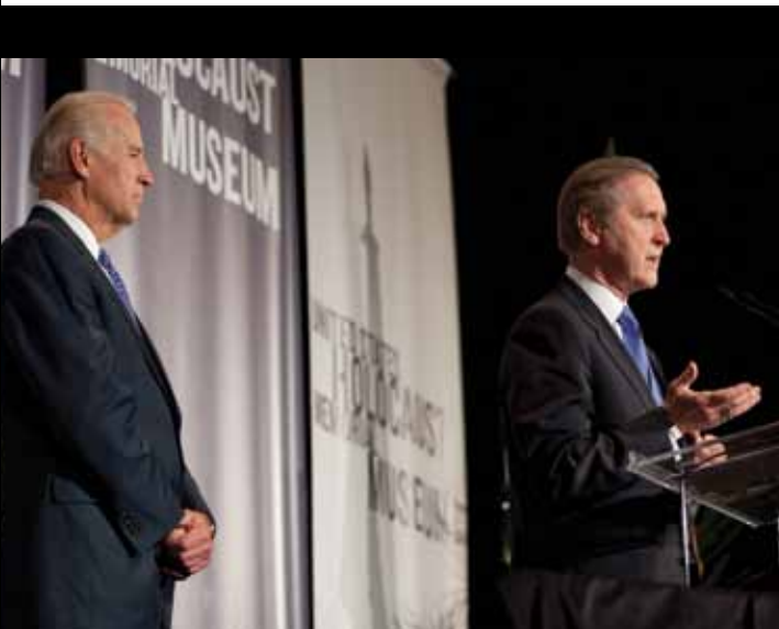
ABOVE: The 2009 National Tribute Dinner honored Genocide Prevention Task Force co-chairs former Secretary of State Madeleine Albright (who appeared via video) and former Secretary of Defense William Cohen. Vice President Joe Biden gave remarks at the dinner. From the left: Vice President Biden and Secretary Cohen.