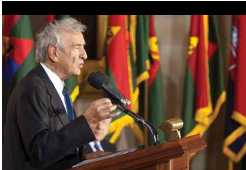
LEFT: Museum Founding Chairman Elie Wiesel speaks about the dangers of Holocaust denial and antisemitism.