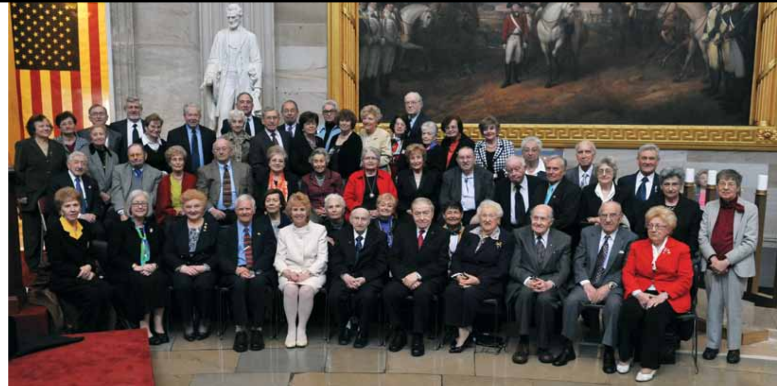
ABOVE: More than 70 Holocaust survivors volunteer at the Museum. Over 50 are shown above attending the Rotunda ceremony along with five Polish rescuers (at upper right). The survivors are an invaluable asset to the Museum, and their contributions are vital to its success, from working with staff, conducting research, and translating documents, to sharing their personal histories.