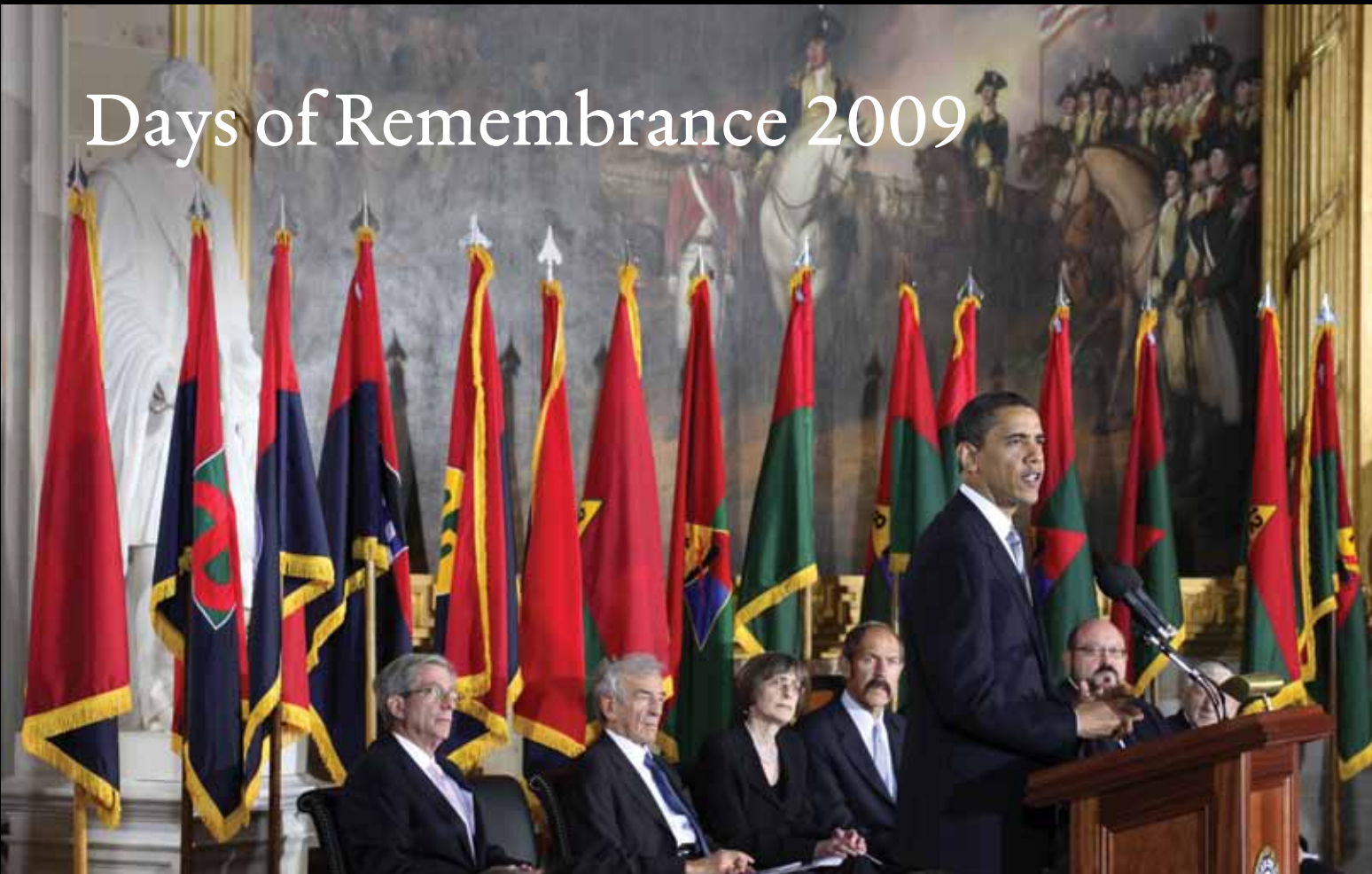
ABOVE: President Barack Obama delivers the keynote address at the annual Days of Remembrance ceremony held in the Capitol Rotunda. Holocaust survivors, liberators, members of Congress, White House officials, ambassadors, Museum supporters, and community leaders gather to remember the victims and reflect on the 2009 Days of Remembrance theme, "Never Again: What You Do Matters."