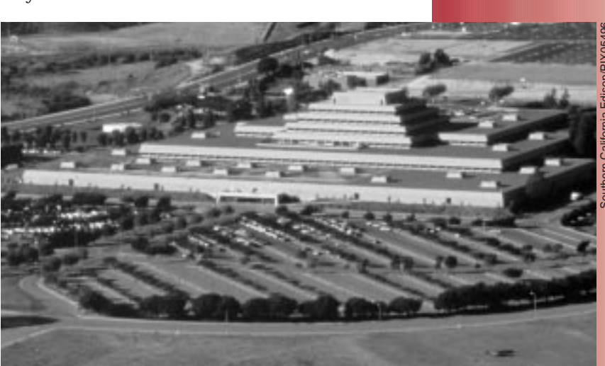
The Chet Holifield Federal Building is a 1997 Federal Energy Savers Showcase award winner.