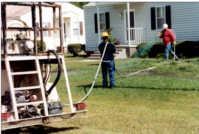
Workers complete the last stage of the construction project: repairing and reseeding lawns.

A number of new energy-efficiency projects are in progress at Camp Lejeune, and more are in development. Upgrading systems to monitor and manage energy use on the base is a high priority involving 23 new master electric meters and a