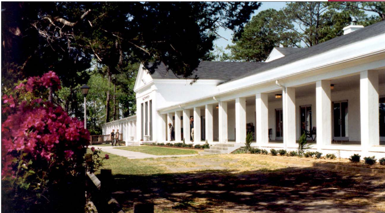
A GHP retrofit of Camp Lejeune's Marston Pavilion conference center is underway.

SiteNet system to integrate operation of power systems and load management plans. The base is installing infrared heat in hangars, implementing other lighting upgrades, and implementing a range of other improvements in projects financed by utility contracts and energy savings performance contracts, or paid for by appropriated funds. A GHP retrofit for the Marston Pavilion conference center is underway, and the base is studying the feasibility of GHP retrofits for more family housing units.