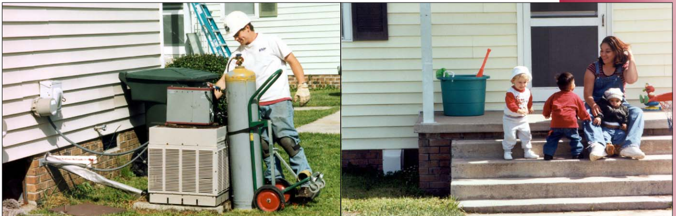
At left, an employee of Humphrey Mechanical Engineering discharges the refrigerant from an old heat pump in preparation for removing it. After installation, the small white box at foundation level seen in the lower left corner of the photo at right is the only outdoor evidence of the new GHPs.

management system to turn water heaters and HVAC systems off during peak load periods, which is appreciated both by residents and by maintenance staff who have fewer calls and complaints to handle.