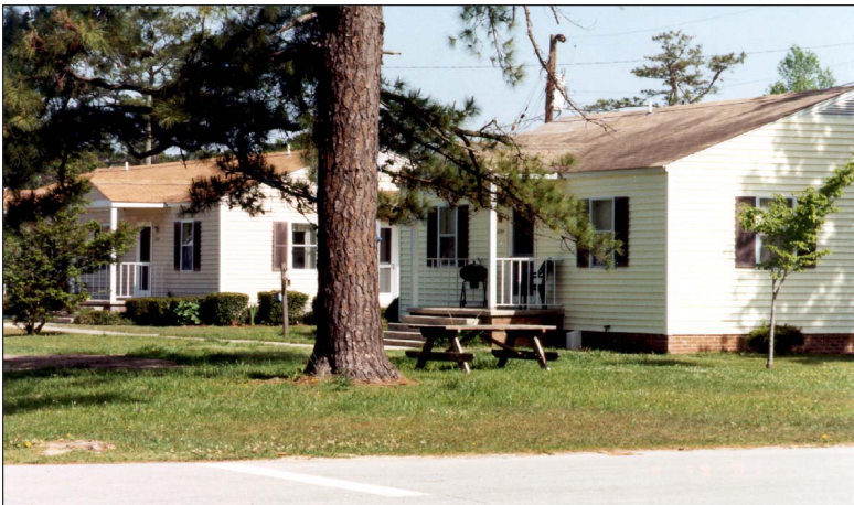
Almost half of Camp Lejeune's 4477 family housing units were retrofitted with GHPs.