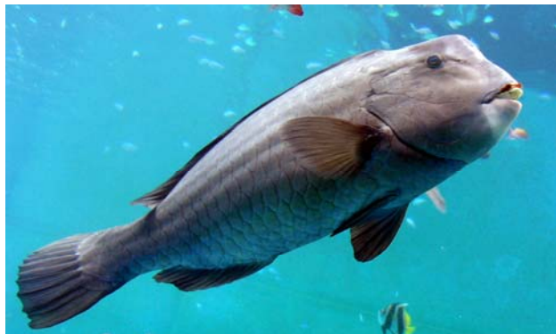
Churaumi Aquarium Ocean Expo Park, Okinawa, Japan.

The bumphead parrotfish is listed as a Management Unit Species (MUS) in the Coral Reef Ecosystems Fishery Management Plan for the Western Pacific. In fisheries management, MUS typically include those species that are caught in quantities sufficient to warrant management or specific monitoring by NMFS and the Western Pacific Regional Fishery Management Council in U.S. Pacific areas.