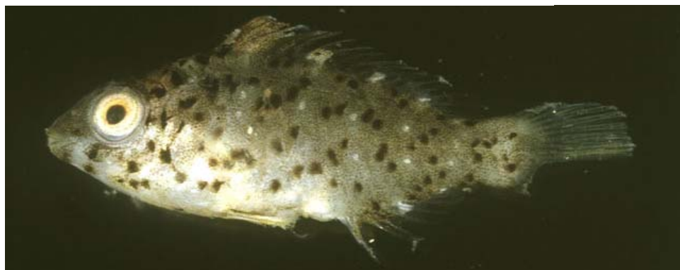
Figure 2. Juvenile, New Caledonia.