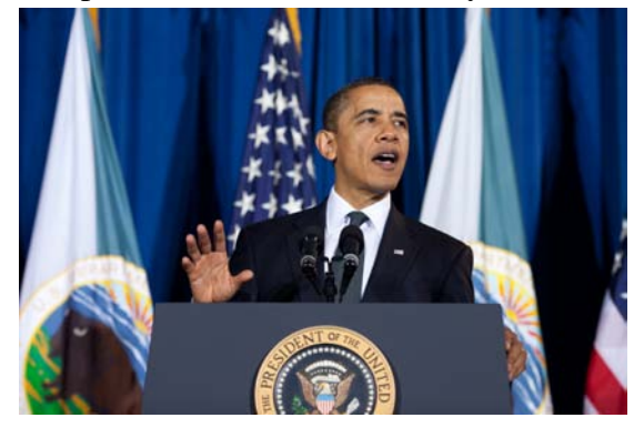
President Obama delivering opening remarks at the White House Tribal Nations Conference.

At the second White House Tribal Nations Conference on December 16, 2010, President Obama, several cabinet secretaries, and other senior administration officials from the Departments of the Treasury, Defense, Justice, the Interior, Agriculture, Commerce, Labor,