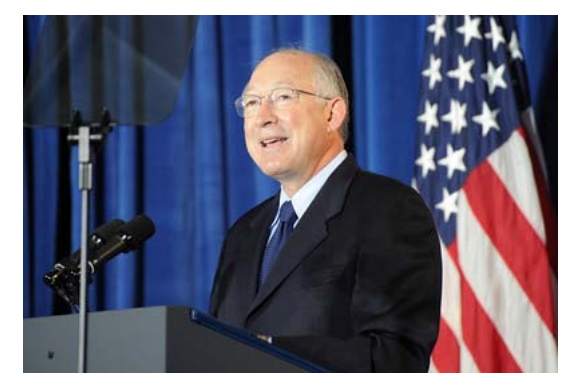
Secretary of the Department of the Interior, Ken Salazar.

Secretary Salazar's remarks were followed by the presentation of the colors by the Navajo Code Talkers, the Flag Song by Hunter Street (Hidatsa/Dakota), an invocation by Governor James Lujan of the Taos Pueblo, and an introduction of the President of the United States by President Fawn Sharp of the Quinault Indian Nation.