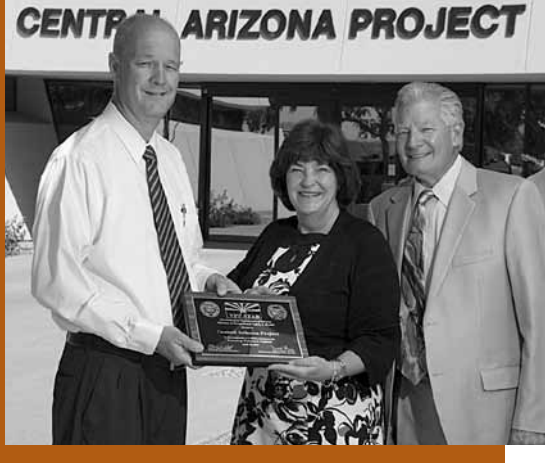
ADOSH presentation of the VPP recertification to the Central Arizona Project.

Training and Education Initiatives: The training and education services offered by ADOSH target a wide variety of industries and sectors. The training classes and activities are free of charge, and informational material is delivered as part of the training efforts. ADOSH aims to provide employers and workers with necessary safety and health awareness training to ensure an active participation in their respective work environments.