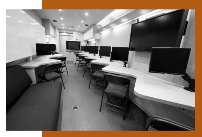
KYOSH IMPACT is a state-of-the-art multi-purpose incident response/ outreach motor coach.