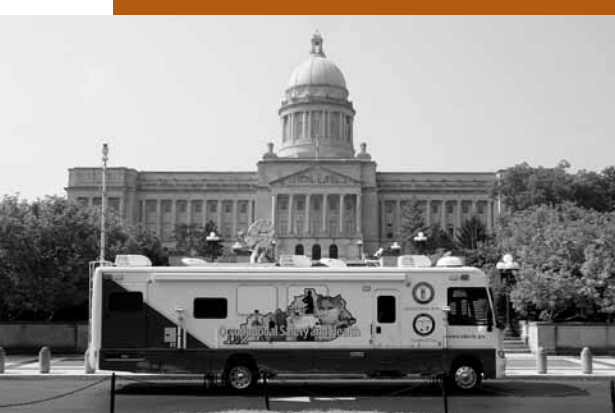
KYOSH IMPACT is used for outreach as well as strategic enforcement efforts.

Labor Cabinet Regional Seminars: In an effort to keep citizens abreast of the services offered by the Kentucky Labor Cabinet, the Cabinet hosted a series of six multi-day seminars across the Commonwealth during the summer of 2010. The seminars showcased all of the Cabinet's agencies and was developed for employers, employee organizations, public works projects, workforce development, workforce education, and registered apprenticeship programs. The Division of Compliance and the Division of Education and Training provided attendees with detailed presentations of their many-faceted services as well as explanations of various statutory and regulatory mandates. The seminars were well received and attended by over 600 participants.