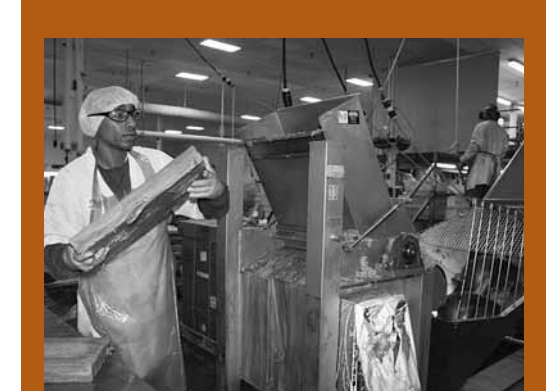
2011 Workplace Safety & Health Calendar: To protect employees, Trident Seafoods' Pier 91 facility makes sure cutting and chopping machines are well guarded.

2011 Workplace Safety & Health Calendar: This worker at NuCor Steel in Seattle wears protective gear that includes flame-resistant clothing and a full-face respirator with a powered air filter.