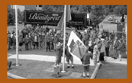
The Simmons VPP celebration was held on September 1, 2010.

Governor's Industrial Safety and Health Conference: Washington's 60th annual Governor's Industrial Safety and Health Conference was held on September 28-29, 2011, at the Tacoma Convention Center. This year the 1,500 attendee conference offered two days of training and education, special recognition of 100 years of the Worker's Compensation Act and had over 80 exhibitors providing the latest tools, technologies, and strategies for workplace safety and health.