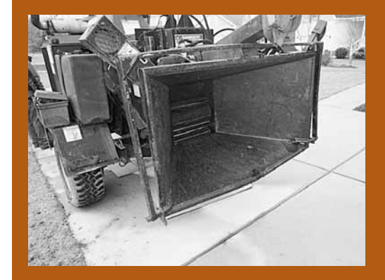
A 14-year-old boy was fatally injured after being pulled into this chipper.

As a result of the investigation, the VOSH Program issued two willful and 12 serious violations and $185,500 in penalties. Criminal charges were also filed for child endangerment and a criminal willful violation of VOSH regulations. The employer pled guilty to the criminal willful violation. The civil case is still pending.