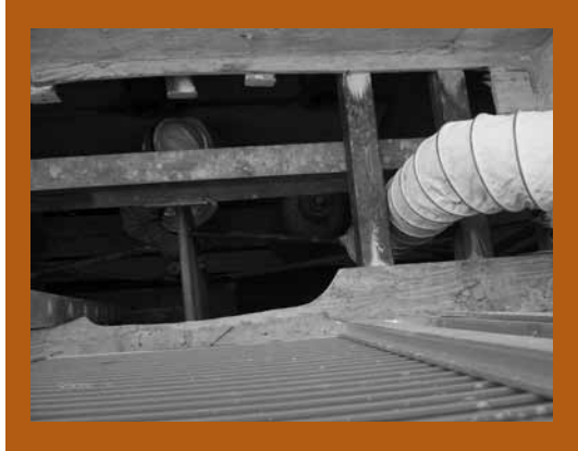
An explosion occurred at the bottom of this wet well, injuring three Posen employees.