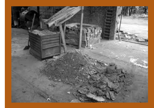
Welch Group Environmental: The Melting Operation.