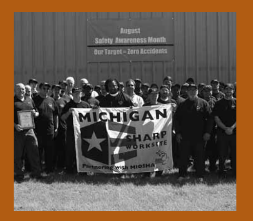
Siemens Industry Metallurgical Services in Benton Harbor Received the Michigan SHARP Award.