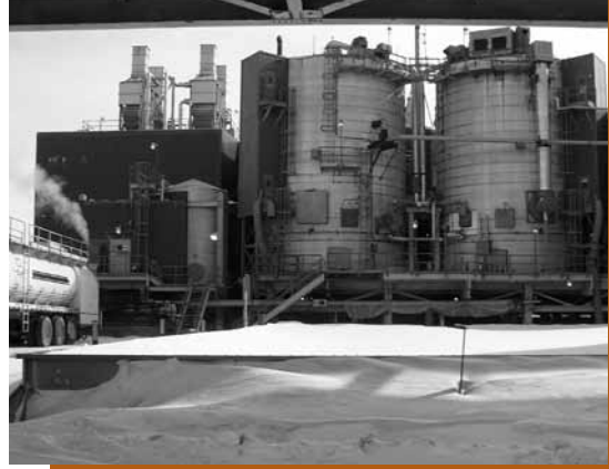
Processing facilities at the Kuparuk Oil and Gas Field VPP Site.

Alaska North Slope BP Gas Process ing Facility.