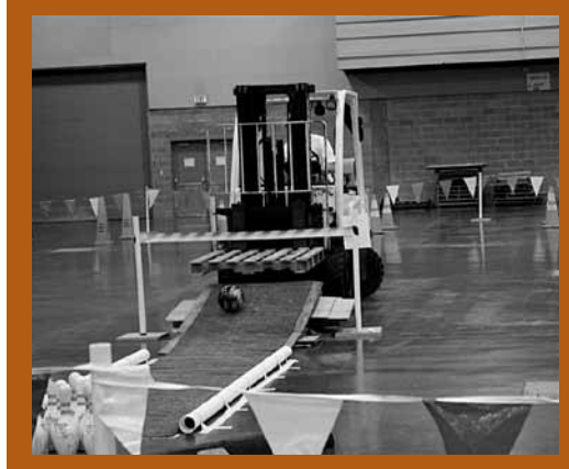
The Columbia Forklift Challenge debuted at the Oregon GOSH conference, where operators negotiated tight turns, stacked pallets and containers, and went bowling.

Historically, there has been high demand for training from businesses that employ Spanish-speaking workers. Oregon OSHA offers a number of materials in Spanish as part of its PESO program. The program includes 17