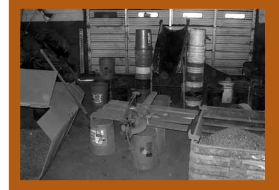
Welch Group Environmental: The Chute System.

North American Midway Entertainment: On October 11, 2010, South Carolina OSHA responded to a worker fatality at North American Midway Entertainment.