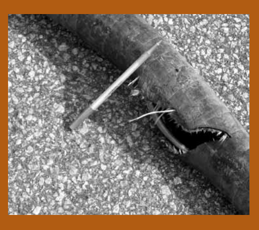
A transfer hose burst, releasing a heavily concentrated cloud of ammonia gas.