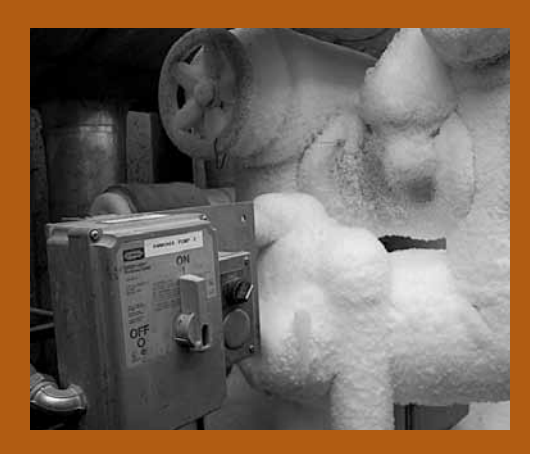
Excessive ice build up on valves was a PSM violation at Select Onion.