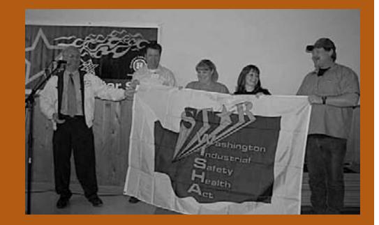
The Hampton Mills VPP celebration was held on May 13, 2010.