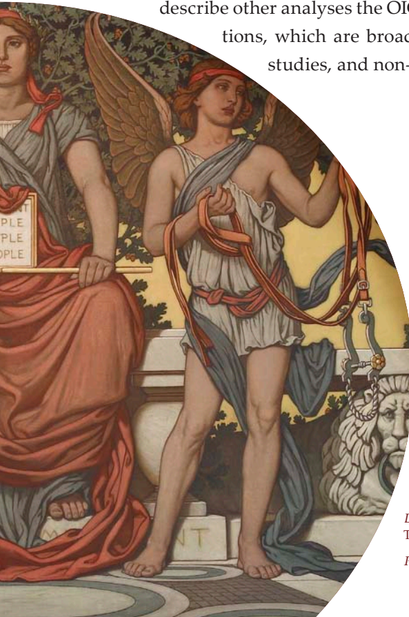
LEFT: MURAL DEPICTING GOVERNMENT, THOMAS JEFFERSON BUILDING.

REVIEWS , which include traditional forms of analyses such as audits and investigations, but is used most often to collectively describe other analyses the OIG performs such as inspections, which are broadly defined evaluations or studies, and non-audit services.