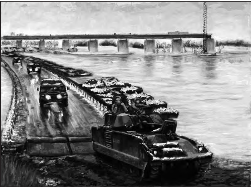
Army Art Collection, National Museum of the US Army

Those US soldiers who flew or drove into Bosnia in late December 1995 as well as those Special Forces soldiers who were already in the