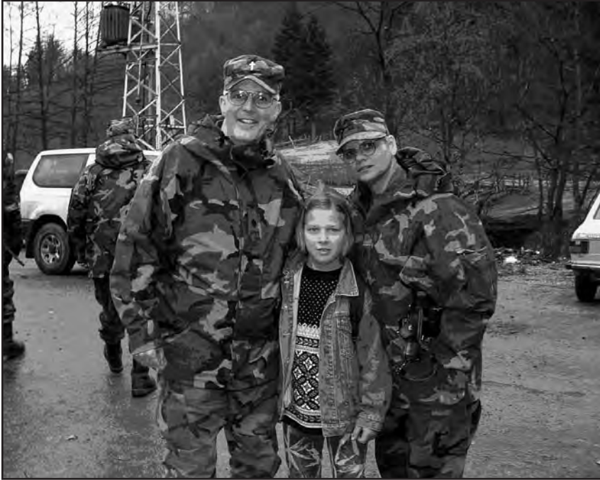
7th ARCOM Public Affairs Office