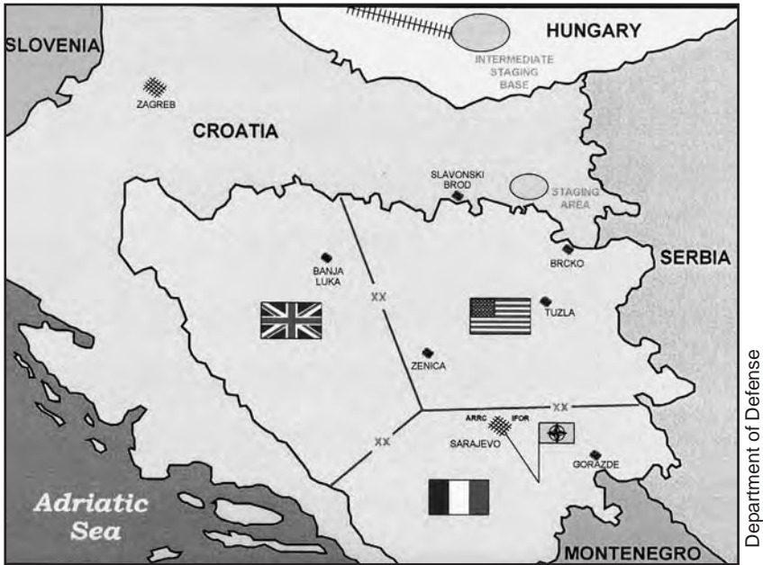
Map 4. Divisions of Bosnia in sectors led by the British, French, and United States.

that he wanted to minimize the US involvement in what could be another Vietnam-type quagmire. He spoke of Bosnia as a “seemingly intractable problem” and was reluctant to project the image of the United States as policemen of the world. Further, Clark made some tough remarks that could not be readily answered. He stated, “It seemed difficult to define the objectives, strategies, and means of Bosnia policy. Of course, we wanted the fighting stopped. But on what conditions, and at what price?” 9