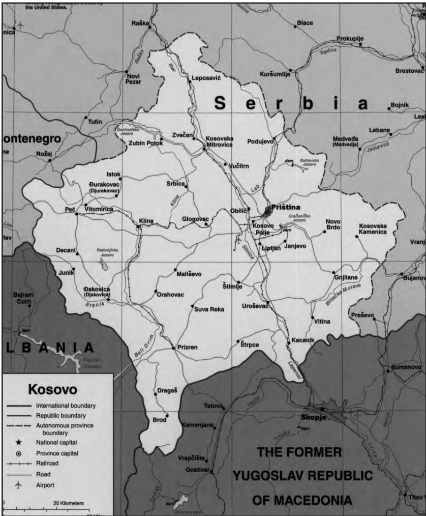
Map 5. A 2000 map of Kosovo.

was subverted by Milosevic's government, which resorted to rigging elections, controlling much of the news media, and was accused of abusing the human rights of its opponents and national minorities. Civilian protests against government corruption led to dozens of deaths. The referendum significantly reduced the provinces' rights, permitting the government of Serbia to exert direct control over many previously autonomous areas of governance, including Kosovo. In particular, the constitutional changes handed control of the police, the court system, the economy, the education system, and the language policies to the Serbian government. 14