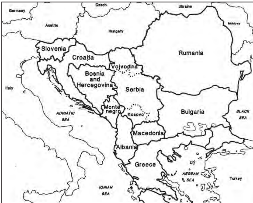
Map 1. The Balkans.

At the time of this writing, the US Army operations in the Balkans are only a fraction of what they were 10 years ago. The term “Balkans” is a common way of describing the geographic region composed of the peninsula-shaped land mass between Italy and Turkey in Eastern Europe. The etymology of the word “Balkan” comes from the Turkish word for mountain or a highland slope. 1 Noting the divisive and fragmented civil history of this region, in the English language the word “balkanize” has come to mean “to divide (a country, territory, etc.) into small, often quarrelsome states.” 2 Modern nations that fall in the geographic region of the Balkans are Albania, Bulgaria, Greece, Rumania, and European Turkey; and the states spawned from the collapsed nation of Yugoslavia, namely Bosnia-Herzegovina, Croatia, Macedonia, and Slovenia. What is left of the former Yugoslavia is now called the Federal Republic of Yugoslavia (Serbia and Montenegro). Sometimes Hungary is considered a Balkans nation and sometimes it is excluded.