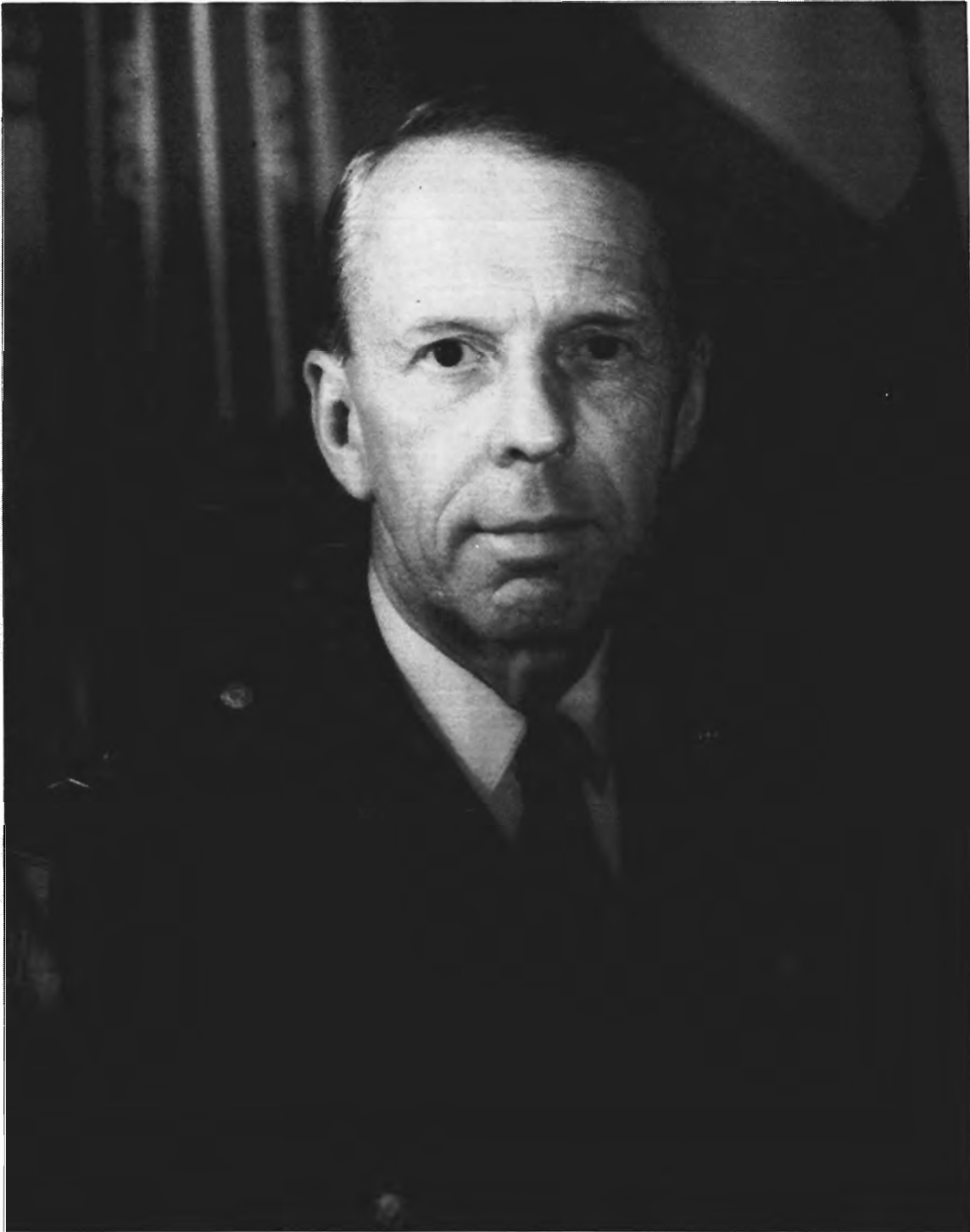
General William E. DePuy