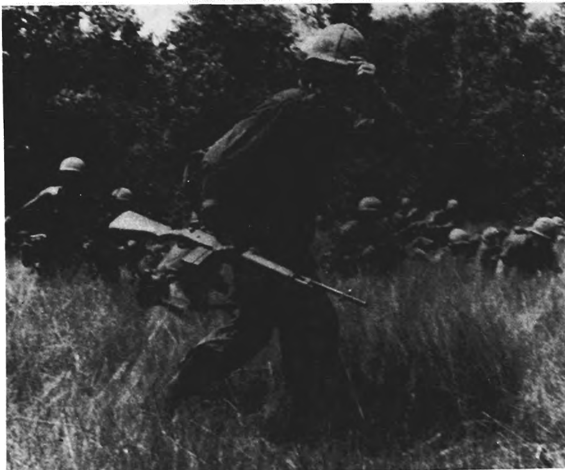
Big Red One troops in action in Vietnam. Although DePuy played an important role in the Vietnam War, he perceived the war as an aberration in the historical trend of warfare.

The 1st Infantry Division consisted of nine infantry battalions, two of which were mechanized; artillery; and an armored cavalry squadron. In addition, the division could call on several battalions of assault helicopters to ferry dismounted infantry onto the battlefield quickly. Its area of operations included the jungled, rice-paddied, and sparsely populated terrain north of Saigon to the Cambodian border along Highway 13 and west to Tay Ninh. Its enemy was the reinforced 9th Vietcong Division, consisting