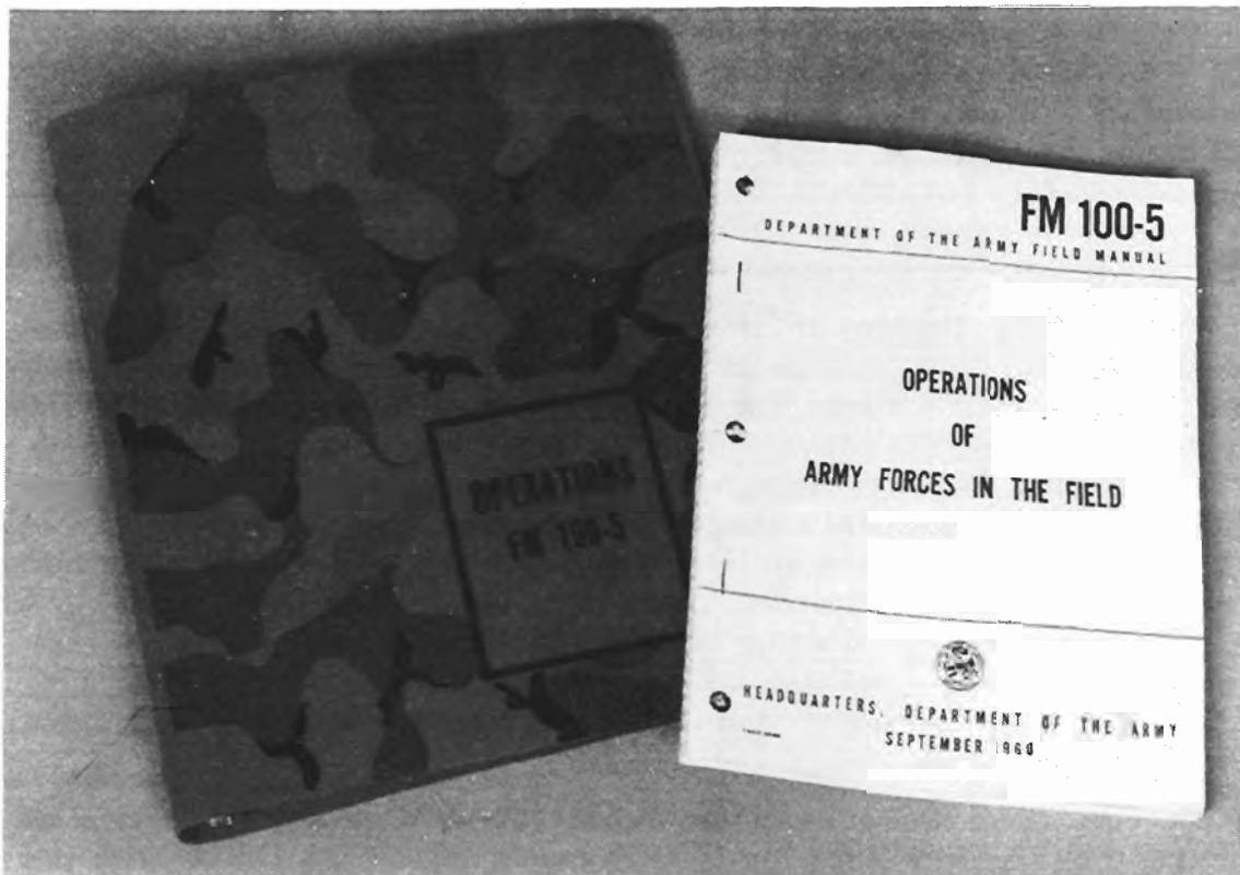
The 1976 edition of FM 100—5, Operations , was published in a camouflage-patterned cover to strike a contrast with earlier manuals and dramatize the doctrine as a break with the past

forces. 7 FM 100—5 accepted “force ratios” as a primary determinant in battle and specified that successful defense required the defender to have no less than a 1-to-3 ratio to the attacker. Successful attack required a 6-to-1 superiority. The manual stressed that cover (protection from enemy fire), concealment (protection from enemy observation), suppression (disruption of the enemy’s fire with one’s own fire), and teamwork (cooperation between the branches of the Army and between the Army and Air Force) were essential to victory on the battlefield.