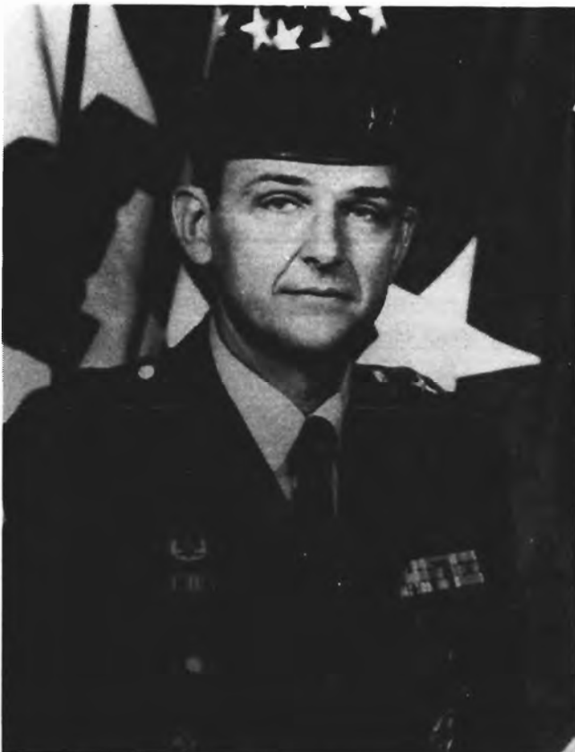
Major General (later General) Donn A. Starry

of a field commander employing his force as he sees fit. When a field commander prescribes his unit's training and war plans, he has ultimate authority over its tactical doctrine. Therefore, without the field commanders' active collaboration in the doctrinal reform process, they would not feel obligated to adhere to doctrine developed only by TRADOC. "It will not suffice to simply send our training circulars out and trust that they will be acclaimed on the basis of their eminent logic," Starry warned his boss after a visit to Europe in April 1974. "Groundwork must be laid, it must begin in the chain of command; like everything else, one has to talk about an idea persuasively for a while before it has any chance of being accepted." Starry left no doubt as to the importance of this persuasive effort: "I am fearful that we won't make the headway we hope for . . . unless a very carefully thought out preparatory dialogue is set up with commanders all over the world." 11