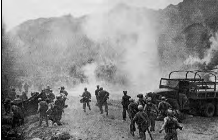
Above: Chinese troops with trucks and 105mm guns of the 1st Cavalry Division or Republic of Korea II Corps in the Unsan area. This photo was probably staged since all or most lost artillery was overrun between 27 Oct and 2 Nov 50 in actions that occurred in early morning darkness. (DA Pamphlet, 1955)