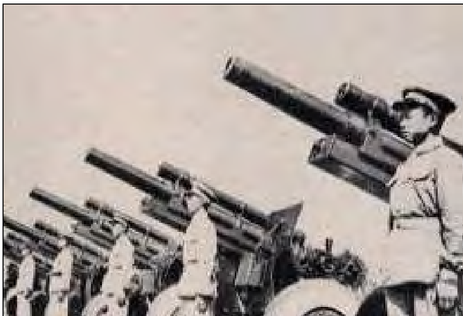
Below: Chinese Communist artillery unit equipped with made in USA M2A1 105mm howitzers captured during China's civil war. The Chinese army in Korea principally used captured U.S. and Japanese weapons but received a steady stream of Soviet-built artillery throughout the war. (DA Pamphlet 30-51, Handbook on the Chinese Communist Army, Sep 52)