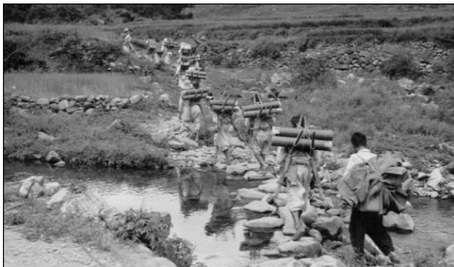
Young porters lugging 105mm shells on A-frame carriers to an artillery unit in the mountains, circa summer 1952. The lack of any road system in the Heart-break Ridge-Punchbowl area necessitated that the Eight Army supplement air drops by employing thousands of Koreans to move supplies forward. (U.S. Army, 19 Jan 53)

artillery has been and remains the great killer of Communists. It remains the great saver of soldiers, American and Allied. There is a direct relation between the piles of shells in the ammunition supply points and the piles of corpses in the graves registration collection points. The bigger the former the smaller the latter and vice versa.” 79 Six months later the budget question still raged and Ridgway was just as adamant: “The only alternative is to effect savings of dollars by expenditure of lives.” 80