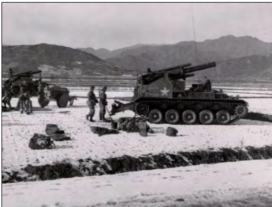
7th Infantry Division 155mm self-propelled howitzers near Sinhung protect the perimeter around the seaport city of Hamhung during the withdrawal of the 1 st Marine Division from the Chosin Reservoir. (U.S. Army, 2 Dec 50)

105mm howitzers fell into Chinese hands with little or no damage and were not destroyed by subsequent air strikes. The North Koreans had little interest in the American-made artillery when they overran much of the South the previous summer because their Army was a totally Soviet-equipped and supplied force. 47 However, the mainstays of Chinese field artillery in 1950 were Japanese 75mm field guns and 105mm howitzers and guns, Soviet 76mm guns, and the “made in USA” 105mm. 48 For obvious reasons, the Chinese were more than happy to add the captured weapons to their inventory.