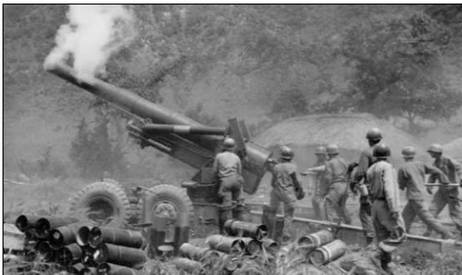
Eighth Army cannoneers reloading their 8-inch howitzer during a fire mission against Chinese targets.

recover five of them. 61 This episode saw the last U.S. field artillery lost to enemy action during the war.