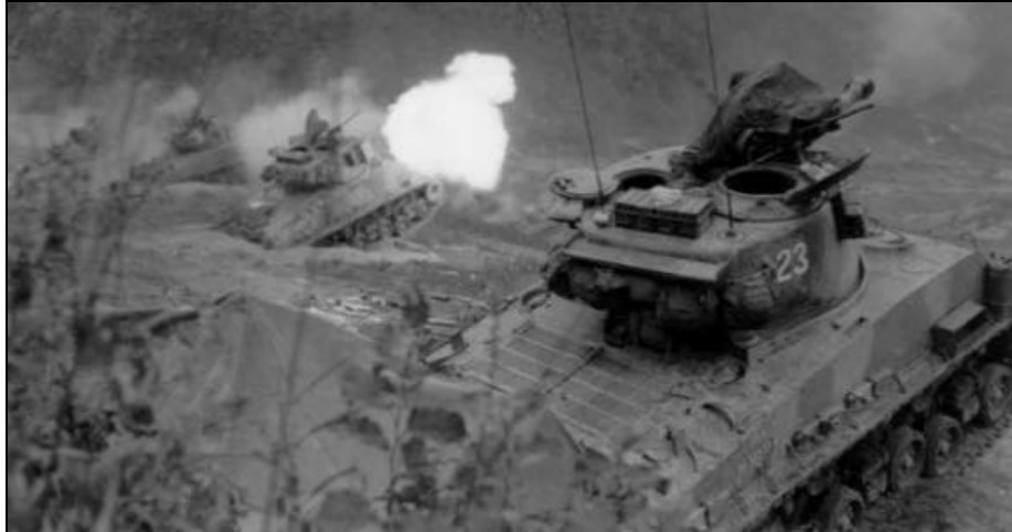
M4A3 Sherman tanks of the 2d Infantry Division, operating as artillery, have backed into excavated fire positions to give their relatively flat trajectory guns more elevation for greater range, Pia-ri area. (U.S. Army, 18 Sep 51)

of the fighting was that of the 24th ID's field artillery, which had to cover 32 miles of the Naktong River front. In 1944 and 1945, such an expanse would have been covered by perhaps 250 divisional and corps guns, sometimes less, sometimes considerably more. 32 In early August 1950, the 24th ID had just 17 105mm and 12 155mm howitzers to do the job. Doctrine may have called for as many as three to four artillery battalions available to support each infantry battalion in combat, but the inverse had become the killing reality just five years after World War II. 33