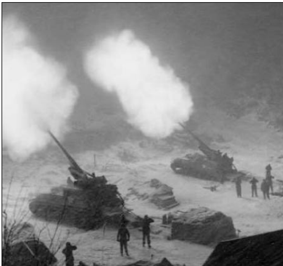
“Long Tom” 155mm self-propelled guns fire in support of the 25th Infantry Division near Munema on the west central front. (U.S. Army, 26 Nov 51)

effort. 75 By fall 1952, the Eighth Army had 36 155mm howitzers plus 44 8-inch guns after a battalion of 105s converted to the 8-inch. Unfortunately the 155s in particular were plagued by ammunition shortages. 76 While defensive fires never failed to be fully employed, useful limited operations that would have saved lives in the long run, such as a planned attack in the Triangle Hill complex by the South Korean 2d Division, had to be canceled. 77 However, since an adequate supply of 438 lb, 240mm rounds existed in Army stocks, two battalions were switched away from the 155mm and given the massive 240mm howitzers in May 1953. 78