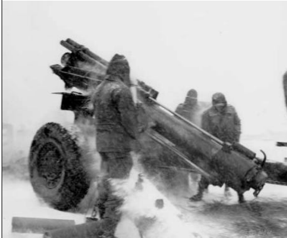
A snowstorm blowing out of Manchuria doesn't stop the crew of this 155mm howitzer from pounding Communist troops on the central front. (U.S. Army, 21 Feb 52)

U.S. airpower, would force it to consolidate. 65 Of course, Van Fleet had no intention of even letting the Chinese get that far.