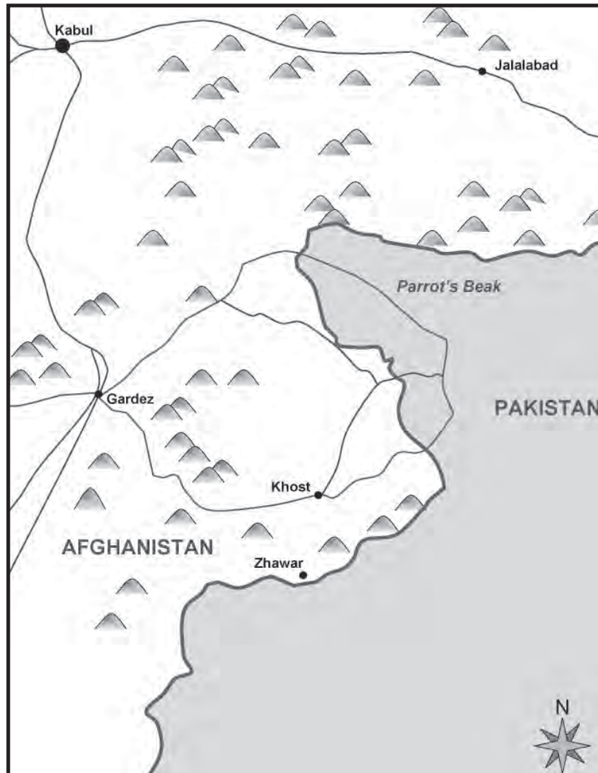
MAP 4. PARROT'S BEAK REGION ON AFGHANISTAN / PAKISTAN BORDER.

guerillas. Tactics included carpet bombing of agricultural regions and wholesale destruction of villages. The Soviets have created a 30-mile deep no-man's-land on the border with Pakistan. This has led to widespread food shortages and destroyed the guerillas' infrastructure in many regions. Soviet commando operations and air strikes against guerrilla caravans bringing in CIA-provided military supplies have forced