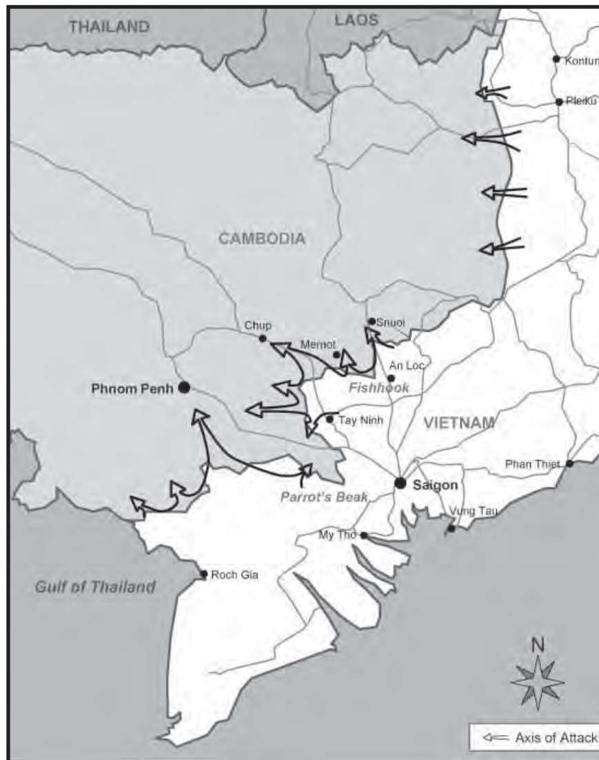
Map 2. The 1970 Cambodia Incursions.

compound, and a training area. There was even a sunken clay swimming pool surrounded by bamboo lounge chairs. Awed by the complex's sheer size, troopers quickly dubbed it "The City." 71