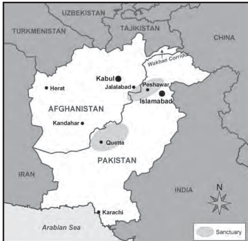
MAP 3. SANCTUARIES ON THE AFGHANISTAN / PAKISTAN BORDER.

By this time Moscow developed greater interest in their southern neighbor. It helped that Afghanistan was the path south and west, the route toward both the oil rich Middle East and the long-coveted warm water port on the Indian Ocean. Also, the geopolitical situation invited action. The United States, the Soviet Union's great power rival, had just concluded its costly war in Vietnam. American presidents Richard Nixon, Gerald Ford, and Jimmy Carter had for the better part of the decade pursued the conciliatory policy of détente toward the USSR. Recent Soviet actions elsewhere in the developing world, for example Angola, had been met with indifference by the free world. And in 1979, the Iranian revolution and hostage crisis consumed much of America's attention. With Afghanistan in chaos, the time for Soviet intervention was at hand.