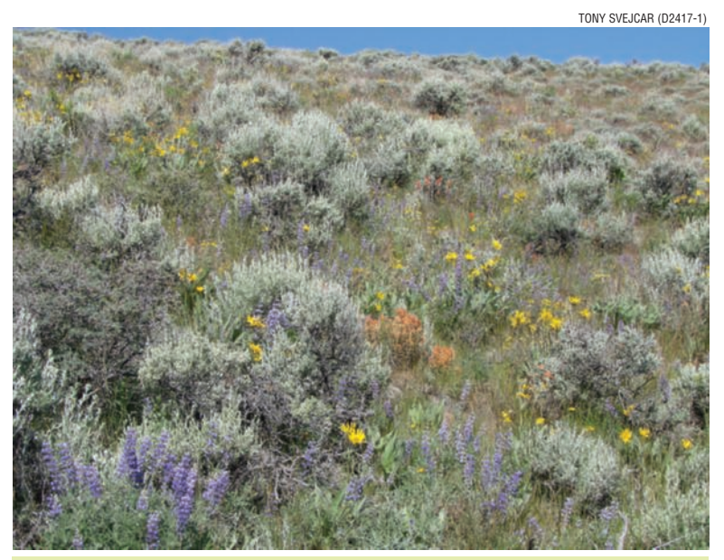
A diverse, functioning rangeland ecosystem with desirable shrubs, perennial grasses, and forbs can help prevent invasive plants from becoming established and taking over.

and disked the soil, both of which opened up space for the existing native plants to expand their range. They also lightly disked parts of the third site and then seeded it with a mix of native plants. This site was next to a wetland, so there was sufficient water available to support the emergence and growth of seedlings.