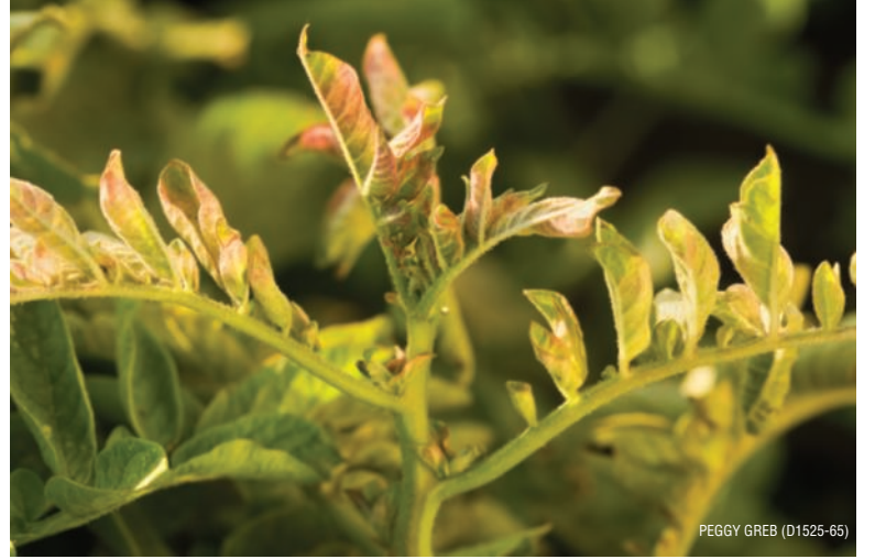
A potato plant showing typical zebra chip symptoms, including rolling up and stunting of the top leaves and purple discoloration.

The discovery is helping growers in affected regions improve their timing and use of insecticide sprays to prevent psyllids