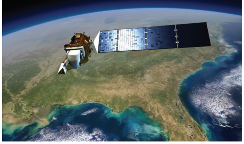
Artist's rendition of the Landsat Data Continuity Mission satellite, scheduled for launch in January 2013. This satellite provides thermal infrared images at the high spatial resolutions critical for many agricultural applications.

derstorms. "With 5- to 15-minute readings from the geostationary satellites, we can monitor the changes in land and air temperatures as the sun rises. Since heat transfer from the land surface is largest around noon, late morning to early afternoon is when there is the greatest potential for turbulence caused by the temperature difference between land and air," Anderson says.