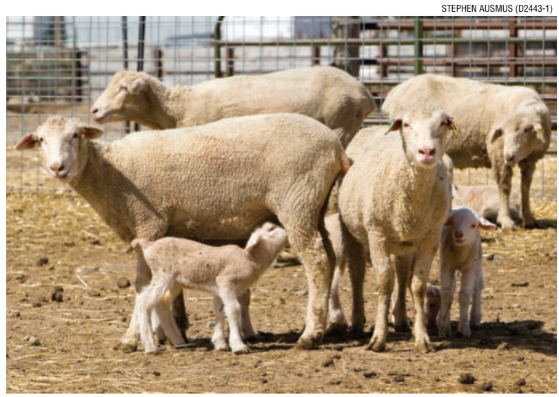
In western areas where some rangeland vegetation doesn't contain enough selenium for grazing animals, ewes that consume a natural high-selenium supplement in their food can pass the needed selenium to nursing offspring in their milk. Story begins on page 14.

The USDA prohibits discrimination in all its programs and activities on the basis of race, color, national origin, age, disability, and where applicable, sex, marital status, familial status, parental status, religion, sexual orientation, genetic information, political beliefs, reprisal, or because all or part of an individual's income is derived from any public assistance program. (Not all prohibited bases apply to all programs.) Persons with disabilities who require alternative means for communication of program information (Braille, large print, audiotape, etc.) should contact USDA's TARGET Center at (202) 720-2600 (voice and TDD). To file a complaint of discrimination, write to USDA, Director, Office of Civil Rights, 1400 Independence Avenue, S.W., Washington, D.C. 20250-9410, or call (800) 795-3272 (voice) or (202) 720-6382 (TDD). USDA is an equal opportunity provider and employer.