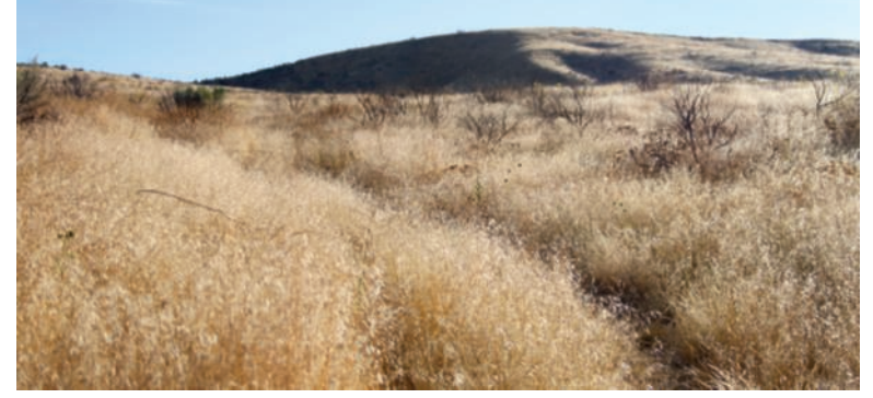
Characteristic sagebrush steppe rangeland where cheatgrass has invaded and choked out most of the desirable grasses and forbs and caused a fire hazard.

Then the team developed strategies that targeted the ecological processes contributing to the successional dynamics at each site. At the first site, they seeded the bare sites with a mix of native plant species and watered them. At the second site they killed the invasive species with herbicides