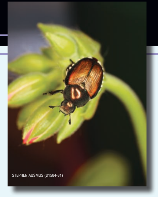
ARS scientists are helping the Azores, islands off the coast of Portugal, control the Japanese beetle ( Popillia japonica ) with the Metarhizium fungus.

In 2003, Vargas introduced to the islands the parasitic wasp Fopius arisanus , a natural enemy of the Oriental fruit fly that has proven highly successful in the Hawaii biocontrol program. The wasp attacks the fruit fly by laying its eggs inside the fruit fly egg, where it continues to develop during the fruit fly larval and pupal stages.