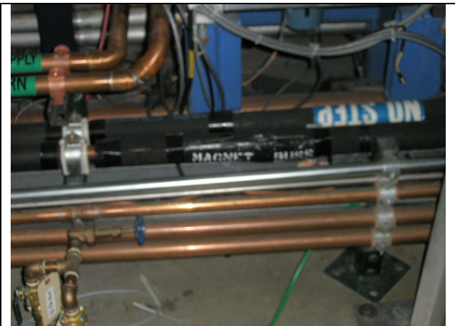
Figure 4: VUV Bus