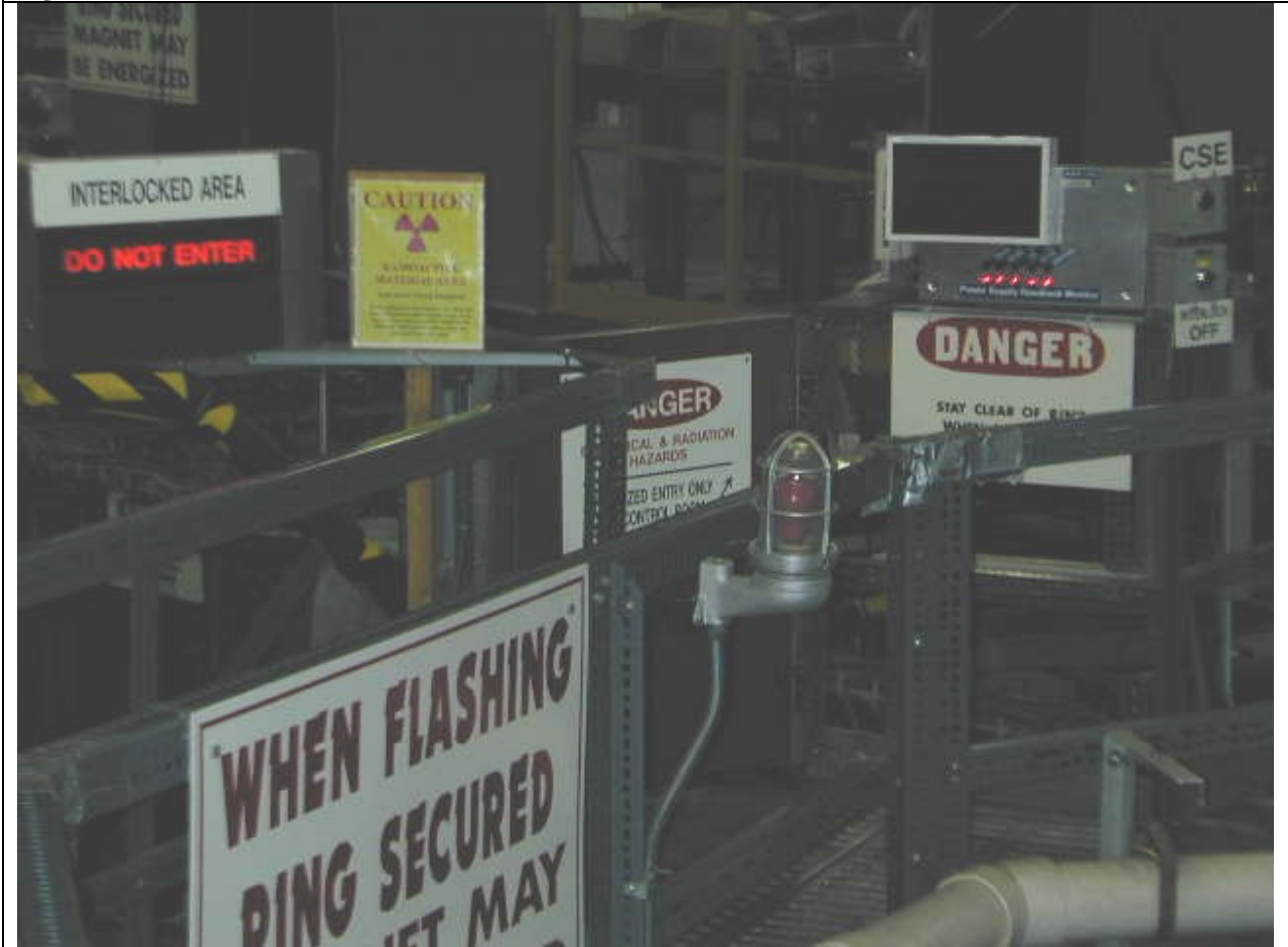
Figure 2: VUV Ring Gate