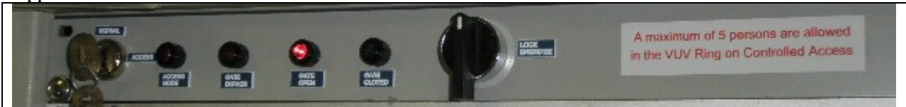
Figure 1: VUV Access Control Panel