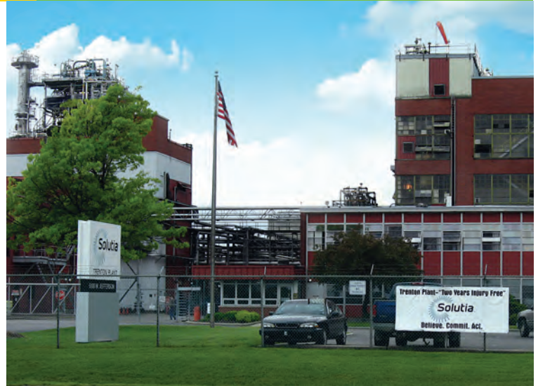
Solutia plant, Trenton, Michigan.

By 2010, all 24 of Solutia's worldwide manufacturing plants utilized sub-meters, which are used to measure electricity consumption, steam flow, and natural gas flow. Solutia has utilized some form of data management software, such as a Data Historian, to collect the information yielded by sub-meters for more than 20 years. Solutia is currently using an automated IP21 Data Historian system that stores data as old as 10 years for some pieces of equipment. After a lengthy screening process, this particular software was selected based on the ease of interaction with Solutia's existing process control equipment, as well as its reported reliability and functionality. Solutia purchased IP21 for use with the Aspen Process Explorer™, which provides robust, real-time analyses of process data to enable managers, engineers, and operators