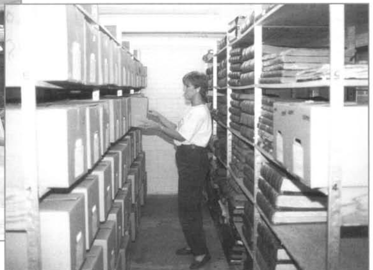
The state of the Aiken County Archives before SHRAB support (left) and after SHRAB support.