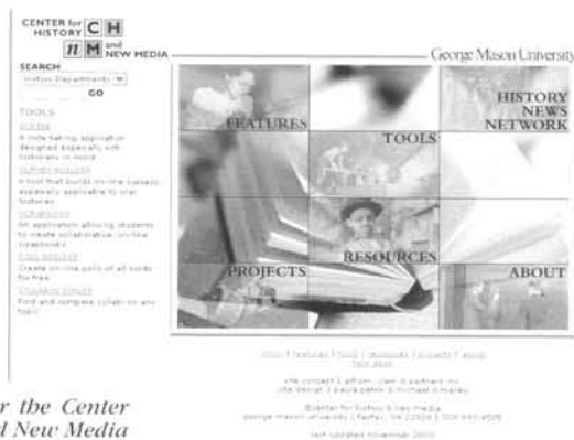
Home page for the Center for History and New Media ( www.chnm.gmu.edu ).

As I indicated above, I believe that the involvement of the National Archives and the NHPRC is vital. The private sector can help, but state and Federal governments are the only ones with the resources to preserve the past in the digital era. As an outsider, I can say strongly that they both need much bigger budgets! ♦