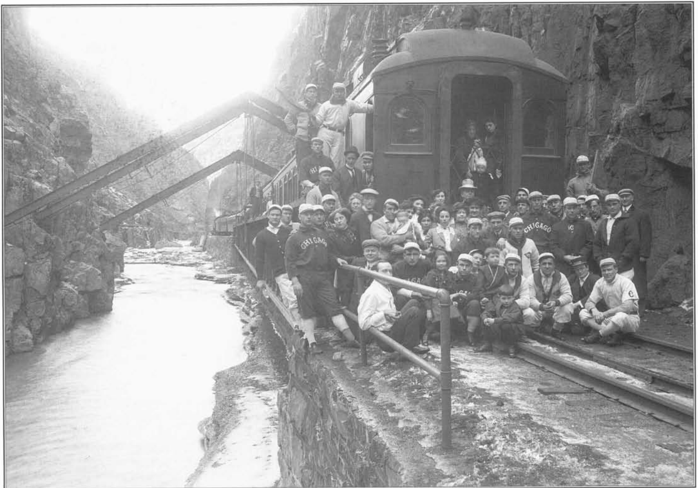
The Chicago White Sox pose by a Denver and Rio Grande passenger car and the Arkansas River at Hanging Bridge, in the Royal Gorge, Colorado, 1910. Research and development for the Western History photography collection ( photoswest.org) was funded, in part, by the NHPRC.

Visit us on the Web at www.archives.gov/grants or e-mail us at nhprc@nara.gov