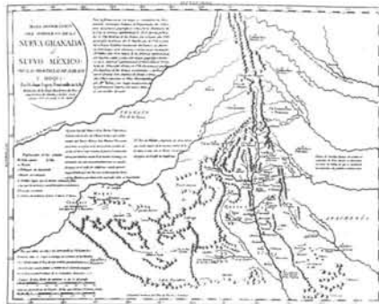
The Calendar to the Microfilm Edition of the Land Records of New Mexico.

ish documents in New Mexico's archives cover the period 1680-1821.