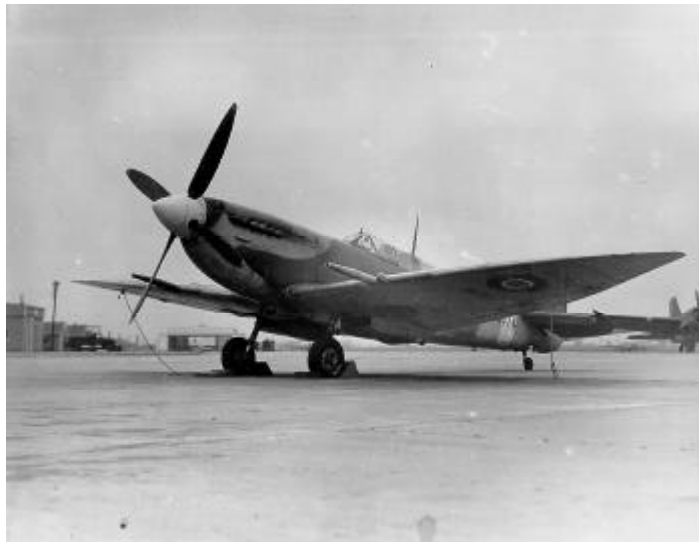
The Supermarine Spitfire, one of the most famous aircraft of World War II. With the Hawker Hurricane and the Spitfire, assisted by early radar technology, RAF pilots defeated their counterparts in the Luftwaffe during the Battle of Britain in 1940.

CALs is a city-county agency which operates a full-service public library that serves seventeen counties in central Arkansas.