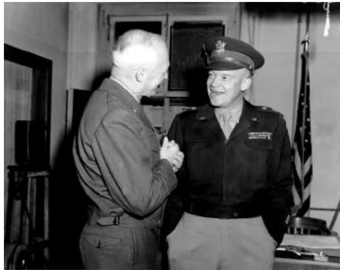
General Henry H. "Hap" Arnold, Commander in Chief, U.S. Army Air Forces, chats with General Eisenhower during their visit to the U.S. Seventh Army command post, April 5, 1945.