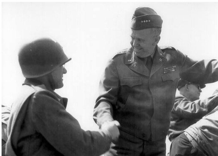
General Marshall was always pleased to meet troops in the field. Here he is shaking hands with men at the Normandy beachhead on June 12, 1944.

Editorial decisions made for the first two volumes were retained for the war years. These included rarely publishing incoming correspondence, vigilant efforts to contain the quantity of annotation, generally limiting our annotation citations to primary sources, and including lots of illustrations. Of these decisions, the most difficult standard to maintain is the one on