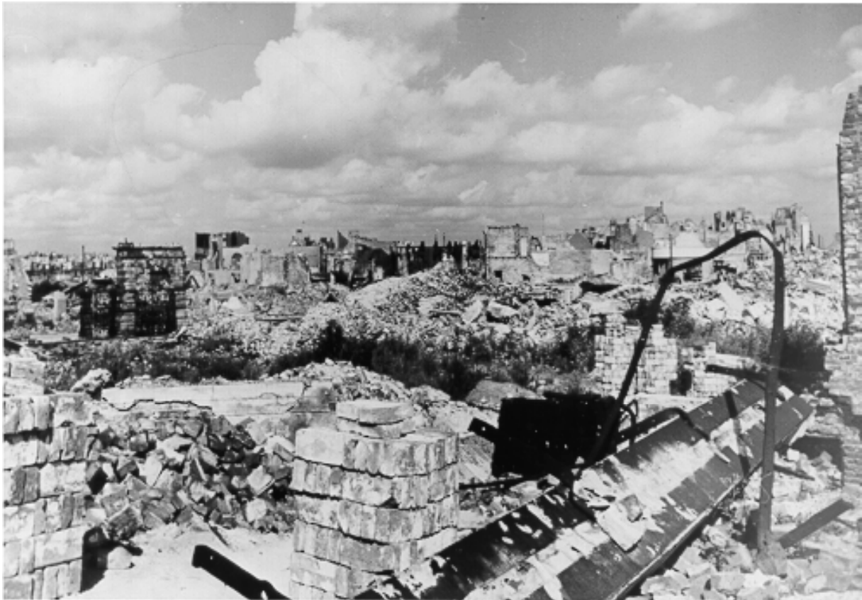
The city of Bremen after wartime air raids had reduced it to rubble.

The Unitarian and the Universalist denominations merged in 1964 to become the Unitarian Universalists. The Universalists also had a wartime service committee, and the Unitarian Universalist Service Committee (UUSC) was the successor of the two earlier committees. The Unitarian Universalists