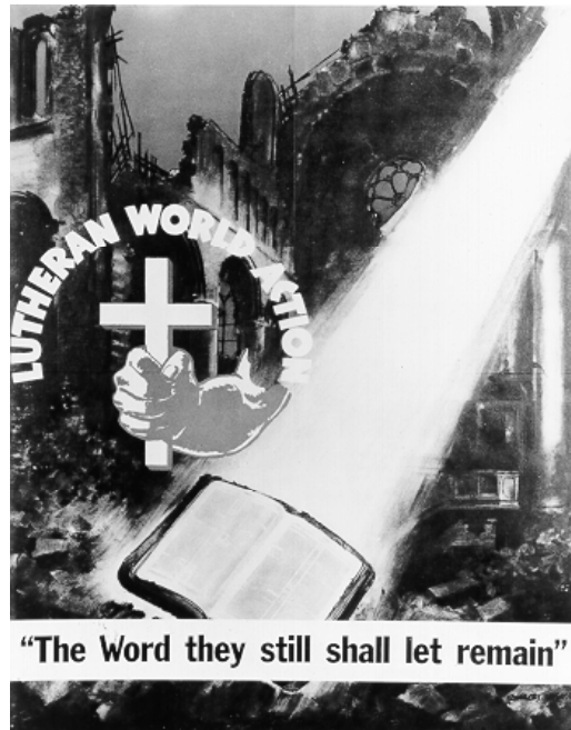
Lutheran World Action, begun in 1940, was the funding arm of the National Lutheran Council (NLC) for overseas relief. The arm-and-cross symbol was familiar to American Lutherans during the war. Here it is superimposed on a photograph of a ruined church to represent the devastation caused by war.

The first nine months of the grant were devoted to records of the oldest organizations in the Knubel Archives. Because these