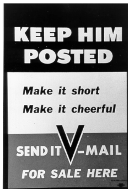
Wartime V-Mail advertisement, from the authors' collection.