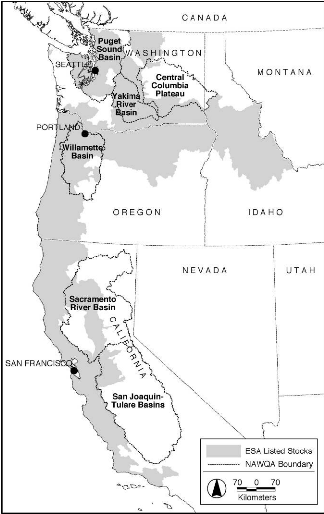
Figure 1. ESA-Listed salmonid ESUs and distribution of NAWQA study basins

Metolachlor is commonly detected in U.S. surface waters and the Pacific Northwest and California with concentrations ranging from below detectable to as high as 143 ug/L (Battaglin et al. 2000). Two of metolachlor's degradation products, ethane sulfonic acid and oxanilic acid, are also commonly detected in surface waters alongside metolachlor; concentrations reach levels as high as 12 ug/L (ESA) and 7 ug/L (OXA). The United States Geologic Survey (USGS) routinely samples surface and ground water for pesticides within designated study basins across the United States as part of their National Water-Quality Assessment (NAWQA) Program. Several of these study basins contain ESA-listed salmon and steelhead and racemic metolachlor use in Washington, Oregon, Idaho, and California (Figure 1).