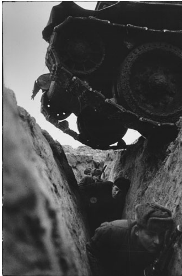
“Kursk Tank Battle,” 1943