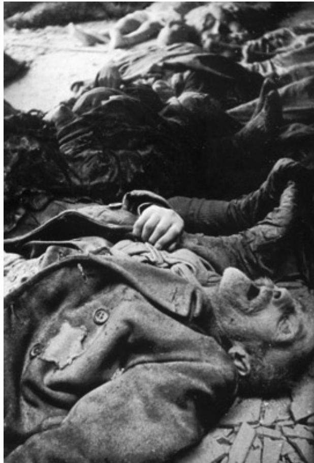
“Murdered Jews in a Synagogue in Budapest,” February 1945

But what about Khaldei's photographs of the liberation of Budapest? Some historians have suggested that his shot of a Jewish couple in Budapest was his contribution to documenting the Holocaust. In Khaldei exhibits in the United States and Israel, this photograph frequently garners the most attention, because of its emotional power and because the subject is explicitly Jewish.