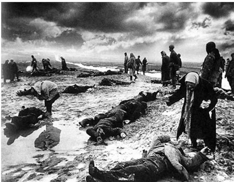
“Grief,” original, 1942 (Dmitrii Baltermants, Courtesy of Michael Mattis) This is the 1965 republished version.

No matter how the photographers and their readers personally responded to these photographs, officially many of the images became icons of the Great Patriotic War. 16 Zelma's landscape of Stalingrad became the official visual record of the battle. Khaldei's famous photograph of Marshal Zhukov on his horse inspired a statue that today still sits at the entrance to Red Square. And yet, despite the iconic status these images achieved as emblems of Soviet victory, after the war many of these photographers experienced their Jewishness directly during the antisemitic anticommunist campaigns of 1948–52. Khaldei lost his job; Markov-Grinberg shed the second part of his name. Zelma's work was not exhibited in the Soviet Union from 1948 to 1958. 17 In the early 1960s, during the thaw in cultural policy, each of these photographers experienced something of a renaissance. Dmitrii Baltermants's series of photographs, Grief , was republished and circulated widely for the first time in 1965. 18