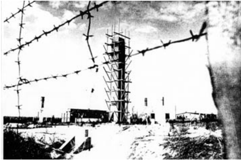
“Majdanek, near Lublin,” August 1944

These photographs were used as evidence of Nazi crimes. We many now also recognize these as evidence of the Holocaust. But at the moment when the camera shutter clicked, did these three photographers understand their photographs to be testaments to a particular Jewish tragedy?