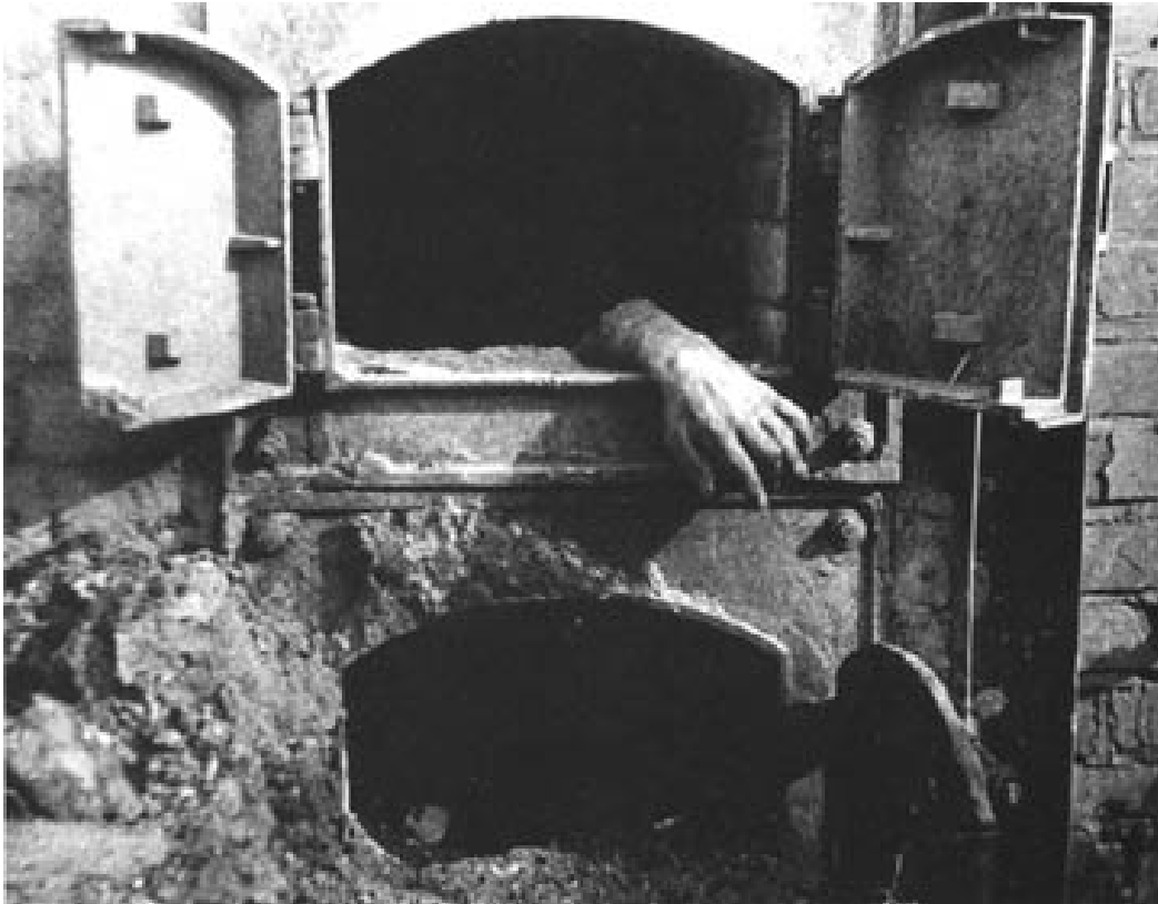
“This Is Unforgettable,” Stutthof, 1945

during the Kursk tank battle in 1943, the biggest tank battle in history. 4 But one of his lesser-known photographs is of the liberation of the Stutthof Concentration Camp that he titled “This Is Unforgettable.” Markov leaves unanswered the question of what “this” is.