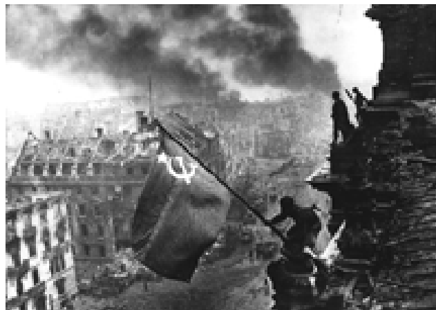
"Raising the Red Flag over the Reichstag," May 2, 1945

During the war, Khaldei documented the declaration of war on June 22, 1941, the Nazi firebombing of Murmansk, battles throughout the south, and the Red Army's path of liberation through Eastern Europe and Germany.