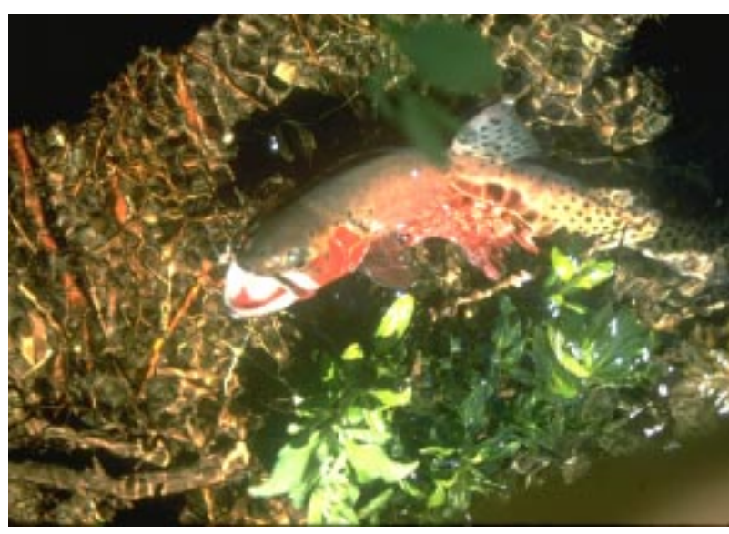
Greenback cutthroat trout recovery efforts have restored this species to more than 40 lakes and streams. Bruce Resembled HISEWS

The black-footed ferret formerly lived throughout the Great Plains from Alberta, Canada, south to northern Texas and eastern Arizona, and with its primary prey, the prairie dog, was an important species in this ecosystem. Prairie dog control programs, which reduced the ferret's food source, greatly impacted the populations of the black-footed ferret. Once thought to be extinct, black-footed ferrets were rediscovered in 1981 near Meeteetse, Wyoming. A captive breeding program, founded by the 18 survivors of this population, has been extremely successful, resulting in a population of more than 400 by mid-1992. In the fall of 1991, 49 juvenile ferrets were released in the Shirley Basin area of southeast Wyoming. The release was the result of considerable landowner cooperation, because about 55 percent of the management area where the ferrets were released is in private ownership. Similar releases were conducted in north-central Montana and the Conata Basin/ Badlands area of South Dakota in 1994. In the fall of 1996, family groups of ferrets (including pups whelped that summer) were released into the Aubrey Valley in northern Arizona. Releases continue at all sites. Now, there are young born in the wild, too!