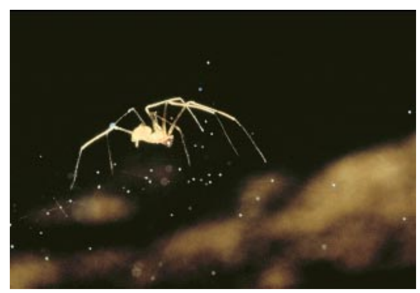
The Tooth Cave spider is part of a unique cave ecosystem that is being preserved in the Texas hill country.

Scientists estimate that more than 500 species in the United States slipped into extinction during the 300 years before the Act was passed.