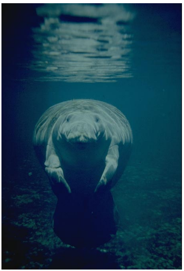
The Florida manatee is being protected through multi-agency habitat protection and law enforcement efforts.

decreases in the range of the Cheat Mountain salamander. Sixty-three known populations of this amphibian exist today, and approximately 95 percent of these known populations are on protected lands, primarily National Forests. The populations are not quite stable and appear to be susceptible to drought, reduction of forest canopy by storms, competition with other salamanders, and pollution, such as acid rain and snow. Protection has been provided to the salamanders through the movement or modification of proposed roads, trails, and timber harvests throughout its native habitat. As part of the recovery effort, numerous areas of the Monongahela National Forest are being surveyed for salamanders. Three quarters of the populations identified as necessary for recovery of the Cheat Mountain salamander are being protected and managed through the cooperative efforts of the State of West Virginia, the Service, and the Forest Service. Additional habitat of the Cheat Mountain salamander also was protected in 1994 as a result of the establishment of the Canaan Valley National Wildlife Refuge.