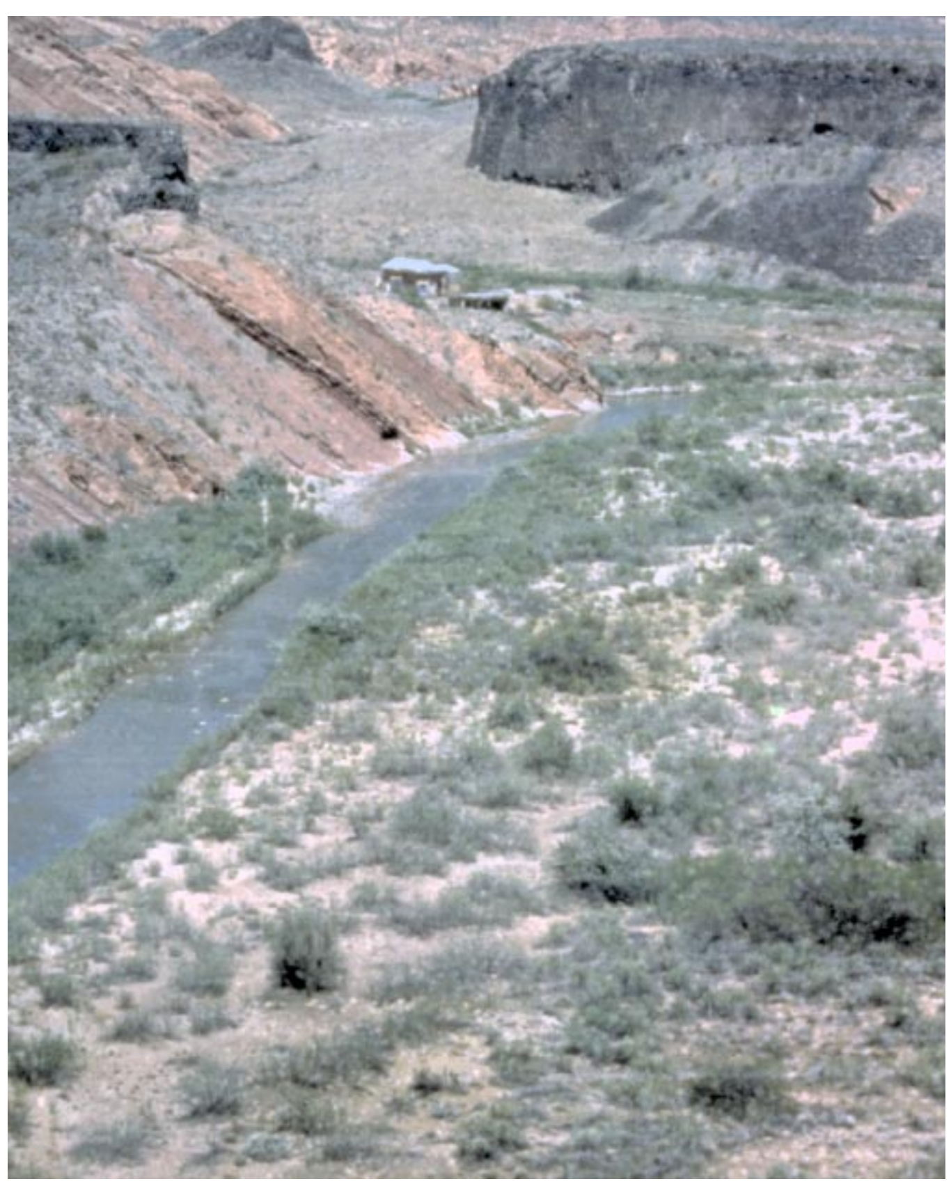
A conservation agreement between land managers in Utah for protection of the endangered Virgin River chub and woundfin also protects habitat for the Virgin River spinedace and many other species. The conservation agreement resulted in the Service being able to withdraw the proposal to list the Virgin River spinedace.