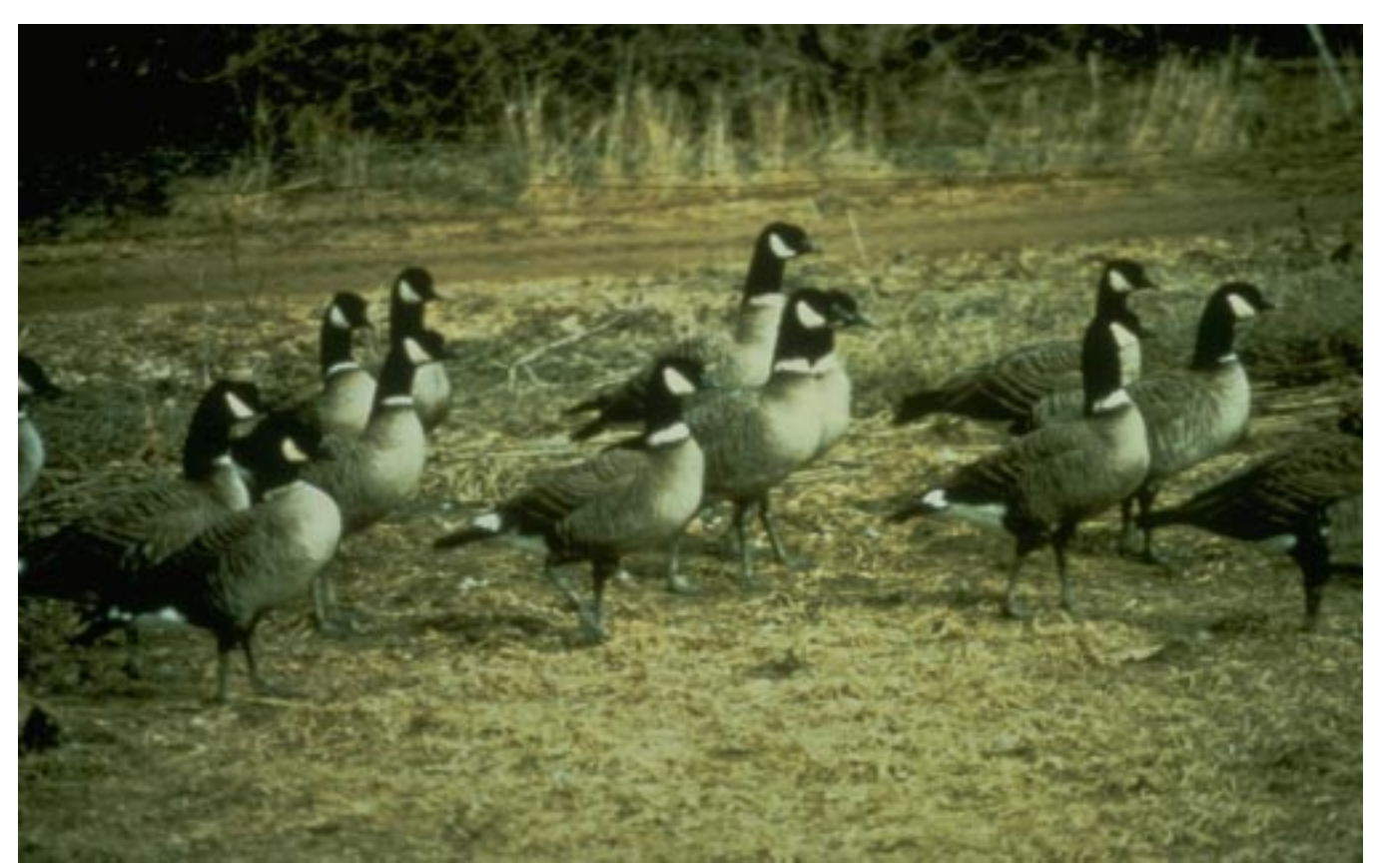
Thanks to successful recovery efforts, the Aleutian Canada goose is no longer endangered.

The rich hardwood forest is a delicate ecosystem in the West Virginia mountains, and contain many of nature's treasures among the tall poplar, oak, and maple trees. A lot of people would not see a salamander as a treasure. The Cheat Mountain salamander, is part of the delicate ecosystem that is threatened by human disturbance. The prospects for this species look relatively bright despite drastic historical