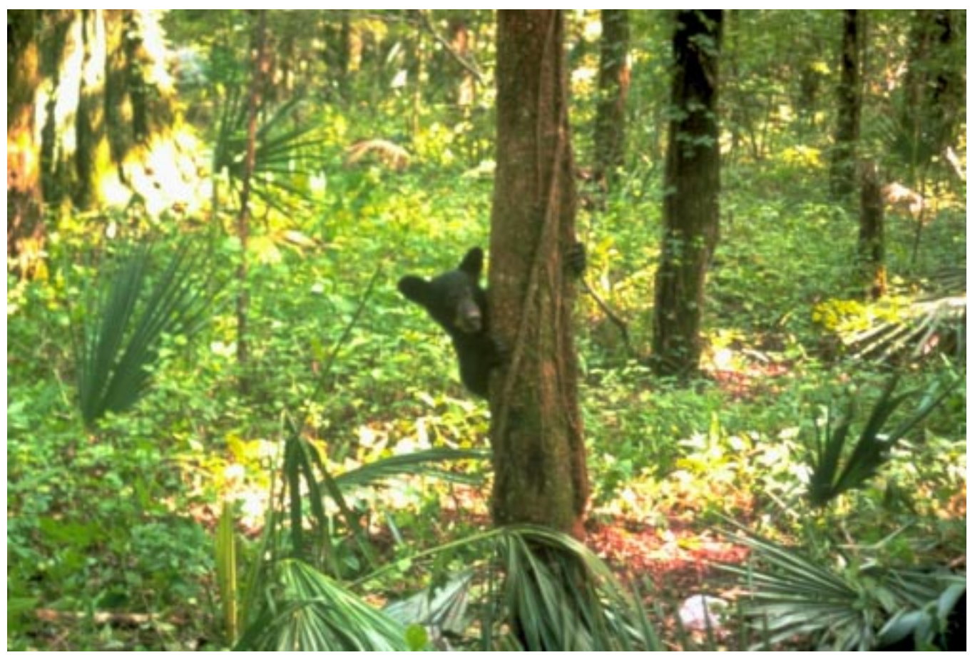
The Louisiana black bear benefits from forest management practices that also support timber product harvest.

both the Black Bear Management Handbook and a comprehensive Black Bear Restoration Plan. A full-time coordinator has been hired to focus on public education and outreach. The BBCC has been instrumental in promoting support for black bear restoration and recovery. The BBCC also ensures that forest management activities include those that support a sustained yield of timber products and wildlife habitats, thereby maintaining forest land conditions necessary for bear recovery. This alliance is a major key to continued successful recovery efforts for the Louisiana black bear and its habitat.