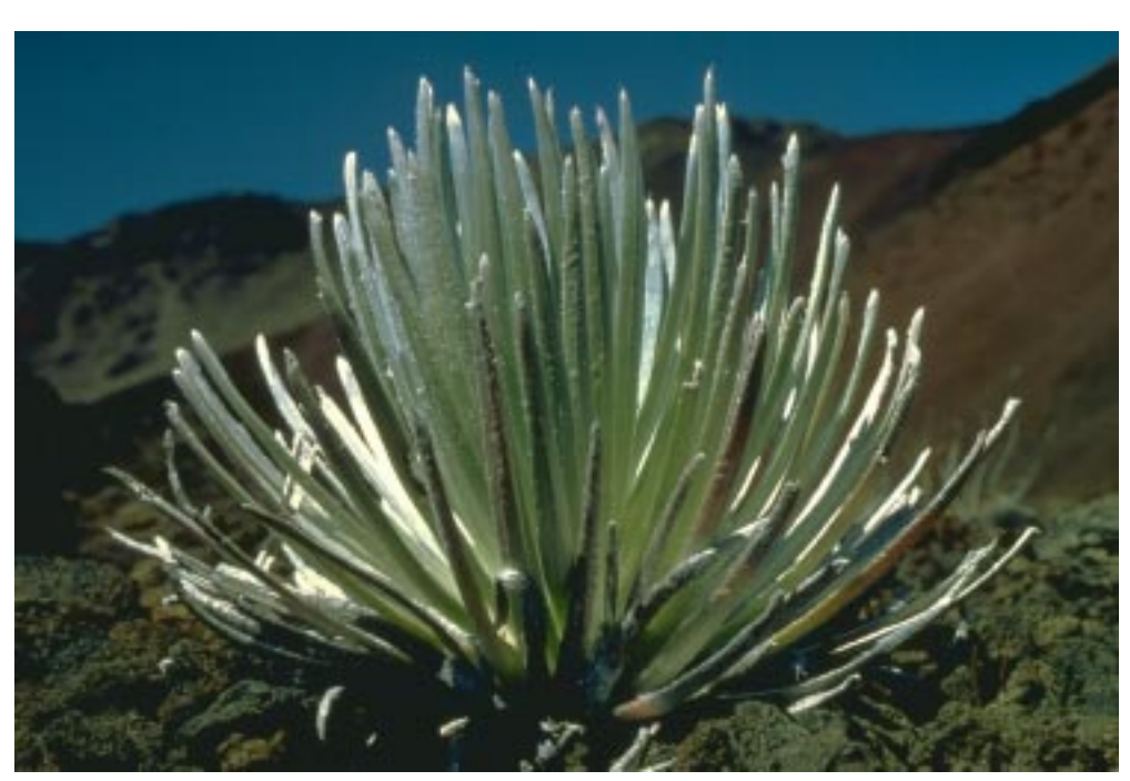
Ongoing Haleakala silversword research is addressing the remaining threats to this species.

Island ecosystems provide unique opportunities to study the evolution of species. Hawaii is a natural laboratory with many species, such as the beautiful Haleakala silversword, that are found no where else in the world. This species of silversword is found only in a 250-acre area in the crater and on the outer slopes of Haleakala, a dormant volcano on the island of Maui, Hawaii. Population declines were attributed to habitat disturbances, detrimental effects from introduced species, and vandalism. The Haleakala National Park was established to aid in the conservation of the species. Although this eliminated some of the threats, others continued, and the silversword was listed in 1991. Now, the most dangerous threat is the loss of the plant's native pollinators, which are being threatened by the Argentine ant, an introduced species that preys on native insects. Biologists are working to find an effective control for the ants. A collaborative effort with the Park Service has saved the species from extinction, but challenges remain.