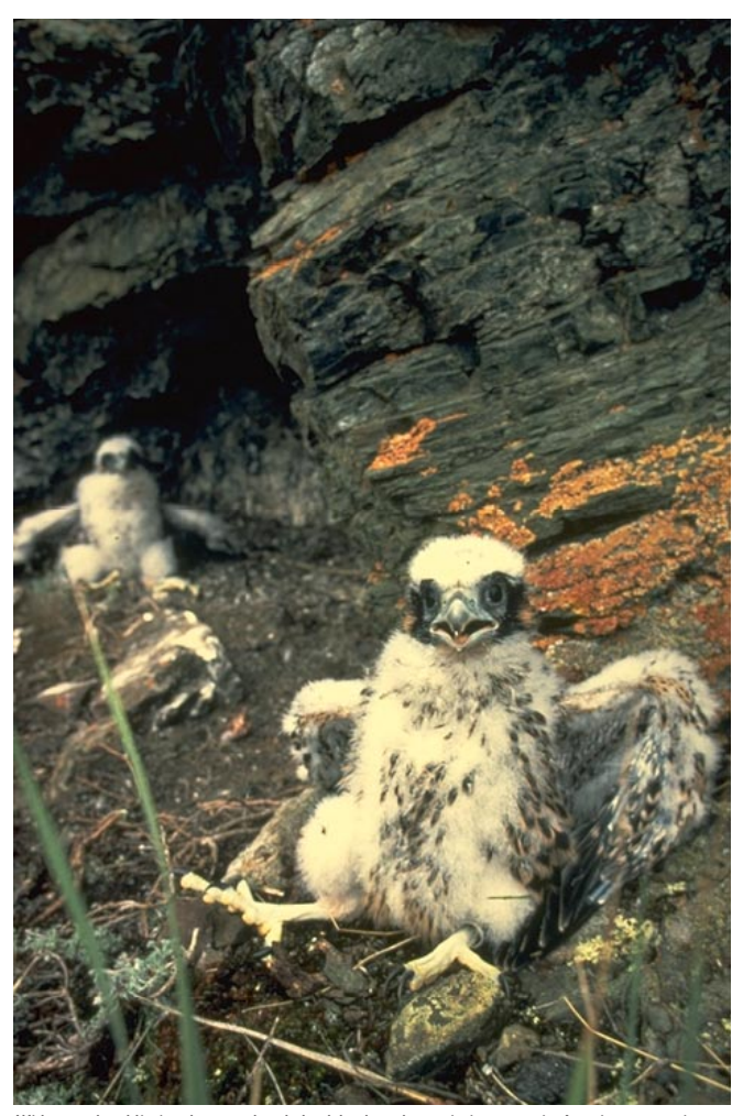
Widespread public involvement has helped lead to dramatic increases in American peregrine falcon populations.

falcons were released into the wild through nationwide recovery efforts. The release of these falcons and other recovery activities have helped to stabilize the falcon's population to the point where it no longer may need protection of the Act.