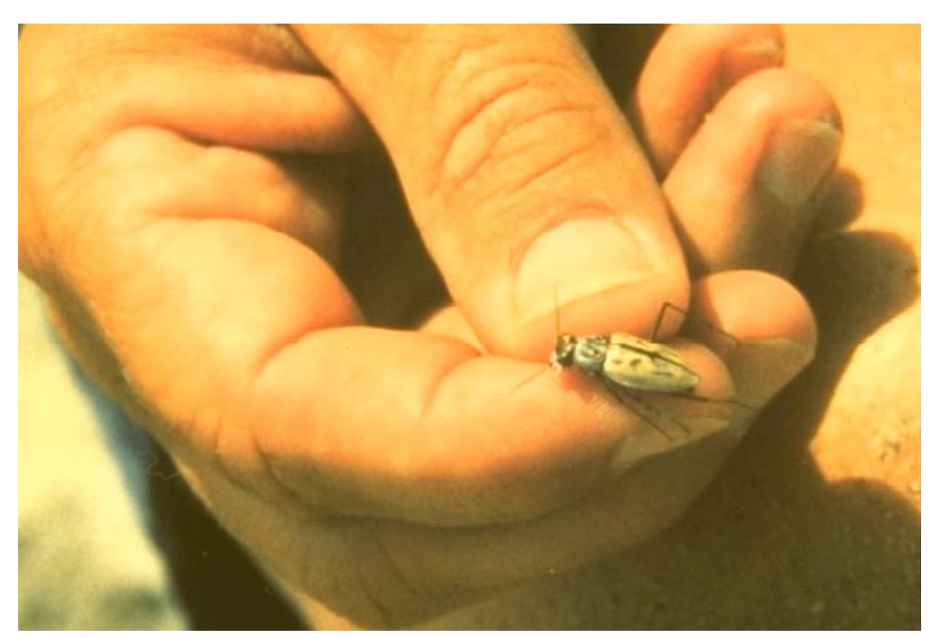
The northeastern beach tiger beetle are mating successfully after reintroduction.

the area where the adult beetles had been abundant during the summer survey. This discovery indicated that the emerged adults had mated successfully and laid eggs, and that the larval young had survived. Future reintroductions using this successful technique will help recover the species.