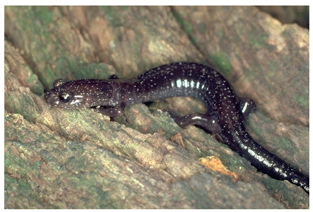
Cooperative management protects 95 percent of known Cheat Mountain salamander populations.

decreases in the range of the Cheat Mountain salamander. Sixty-three known populations of this amphibian exist today, and approximately 95 percent of these known populations are on protected lands, primarily National Forests. The populations are not quite stable and appear to be susceptible to drought, reduction of forest canopy by storms, competition with other salamanders, and pollution, such as acid rain and snow. Protection has been provided to the salamanders through the movement or modification of proposed roads, trails, and timber harvests throughout its native habitat. As part of the recovery effort, numerous areas of the Monongahela National Forest are being surveyed for salamanders. Three quarters of the populations identified as necessary for recovery of the Cheat Mountain salamander are being protected and managed through the cooperative efforts of the State of West Virginia, the Service, and the Forest Service. Additional habitat of the Cheat Mountain salamander also was protected in 1994 as a result of the establishment of the Canaan Valley National Wildlife Refuge.