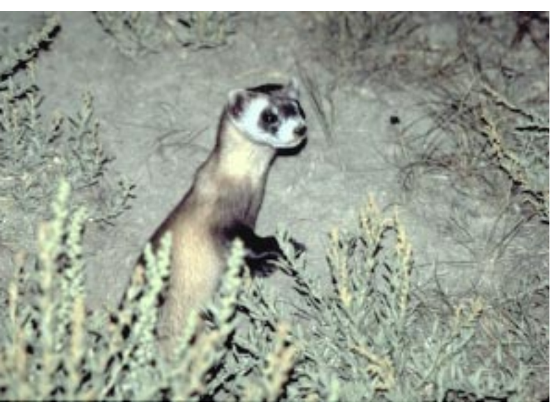
Recovery efforts have increased black-footed ferret numbers from 18 to more than 400.