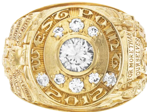
6 Stones Round