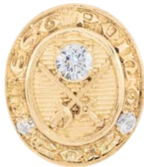
Sword & Saber