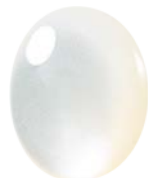
Mother of Pearl