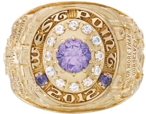
12 Stones Round