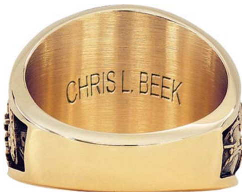
Full Name: Block