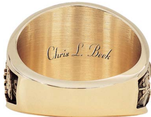
Full Name: Script