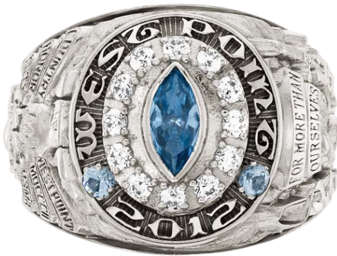
12 Stones Marquis