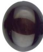
Black Star Sapphire