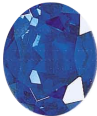
Fire Blue Spinel