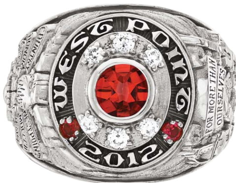
6 Stones Round