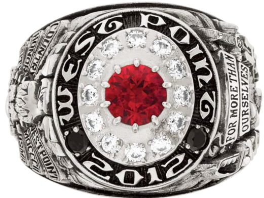
12 Stones Round