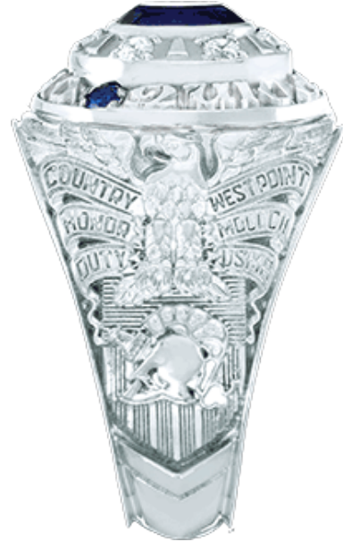
White Gold (Natural Finish)