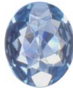
London Blue Topaz