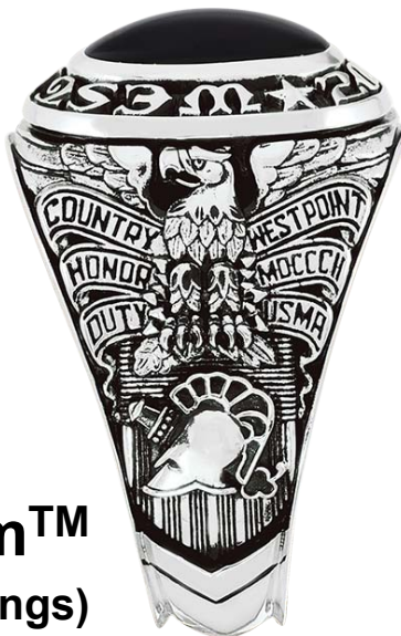
Celestrium™ (Battle Rings)