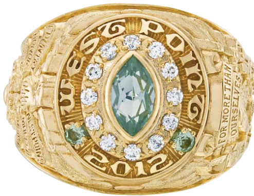
12 Stones Marquis