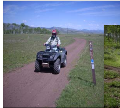
Managed OHV use will ensure access into the future

The DEIS presents several alternatives for revising the current travel plan. They are available for review on line at www.fs.fed.us/r4/ashley/projects/travel_management/index.shtml or pick up a copy at Ashley National Forest Supervisors Office 355 North Vernal Ave., Vernal, UT