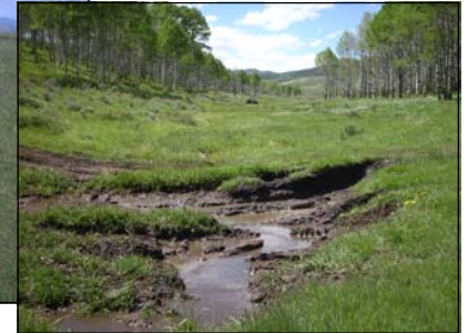
Unmanaged OHV use can result in resource damage. Areas like this will be closed to motorized use.

Providing for the long-term sustainability of National Forest system lands and resources is essential to maintaining the quality of the recreation experience in the National Forests for all users. The phenomenal increase in the use of the National Forest for all recreational activities raises the need to manage most types of recreation, including the use of OHV's.