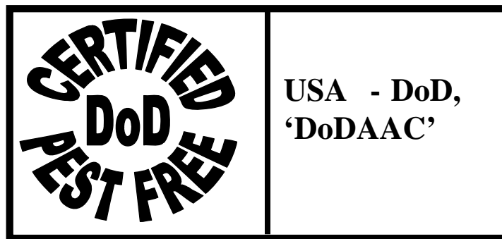
Figure AP3.F1. DoD “Pest Free” Certification Mark

DoD “Pest Free” Certification Marking. Certification and application of the DoD “Pest Free” certification marking (see Figure AP3.F1) is authorized if the material successfully passes the established moisture and visual inspection standards (see paragraph AP3.2.) and has a valid date of pack prior to December 31, 2007. The DoD “Pest Free” certification mark shall display the letters “DoD,” the words “Certified Pest Free,” and the DODAAC of the packaging or shipping activity. The DODAAC provides identification. (See Figure AP3.F1.)